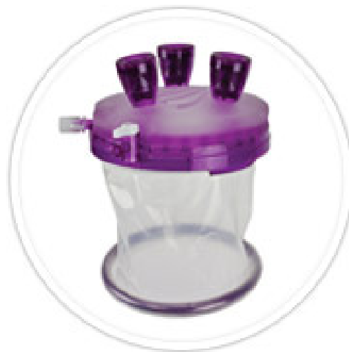
Figure 1. Gelport™ device. Three trocars are in place traversing the gel cap.

Patients are placed in a modified flank position, and a 5 centimeter vertical periumbilical incision is made with the abdominal skin on stretch. After creation of a vertical midline anterior rectus fasciotomy, the abdomen is entered. The Gel Point device (Applied Medical, Rancho Santa Margarita, CA) as seen in figure 1 with three trocars already in place is inserted into the abdomen and pneumoperitoneum is established. Two 5-mm trocars and one 15-mm trocar are used. A bariatric 10-mm rigid laparoscope is used through the 15mm port with a right angle attachment for the light cord to maximize space for triangulation. Standard, non articulating laparoscopic instruments are used in the majority of the procedure. For right sided kidneys, a fourth trocar is placed through the Gelpoint device and a Diamond-Flex retractor ( Genzyme Surgical Products, Tucker, GA) is used for exposure after mobilization of the right lobe of the liver by division of the triangular and coronary ligaments.