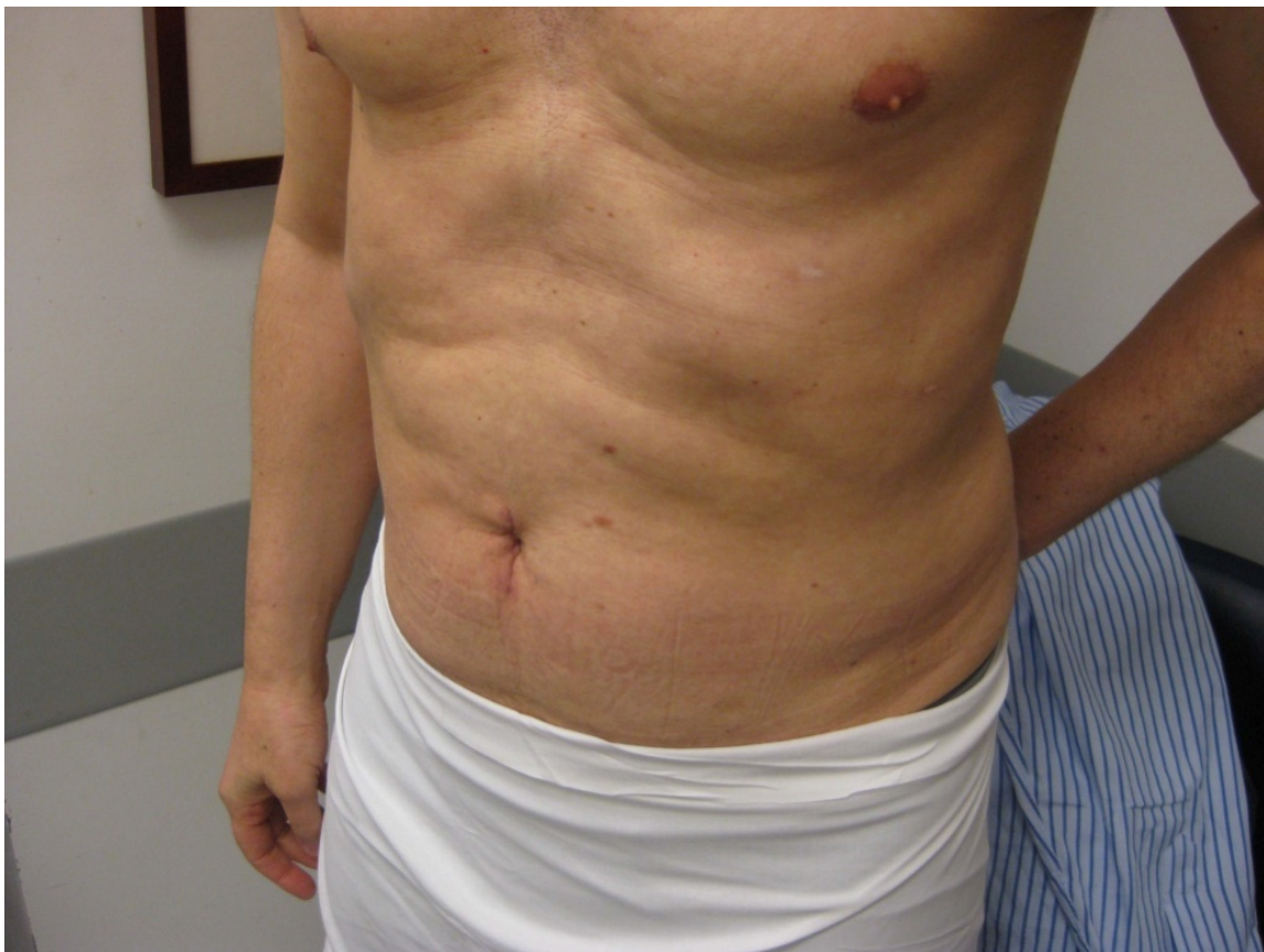
Figure 2. Postoperative incision. In this figure, the patient is 8 weeks postoperatively from a laparoendoscopic single site left donor nephrectomy.

Once the recipient team is ready, the ureter and gonadal vein are divided together at the pelvic brim. The renal artery and then vein are divided using the vascular stapling device. An Endocatch bag is introduced, and the allograft is gently entrapped and extracted by removing the Gel cap. If necessary, the fascial incision is extended 1-2 cm to facilitate removal of the graft, taking care to leave the overlying skin intact without further extension of the incision. Fascia and skin are closed in the standard fashion after ensuring adequate hemostasis. No articulating or specialized laparoscopic instruments are needed and no extraumbilical incisions need to be made. The incision is well-concealed in the umbilicus using this technique (Figure 2).