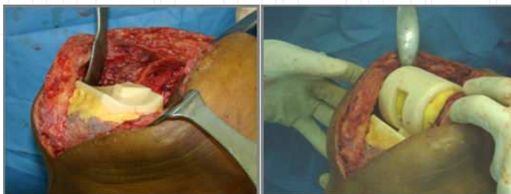
Figure 4. Preformed cement spacer with amphotericin B and fluconazole in a prosthesis with fungal infection.

In the case of fungal infections, the recommended antibiotic is amphotericin B or fluconazole (Figure 4). 5-Flucytosine is not stable and is therefore not valid for use in cement. Amphotericin can cause nephrotoxicity, hepatotoxicity, chills, nausea, and blood disorders, thus necessitating lower doses and more prolonged treatment. Fortunately, the incidence of fungal infection is low. Most infections are by Candida species, of which C. albicans accounts for 60%, C. parapsilosis 20%, and C. tropicalis 20%. More uncommon species include Coccidioides immitis , Sporothrix schenckii , and Blastomyces dermatitidis .