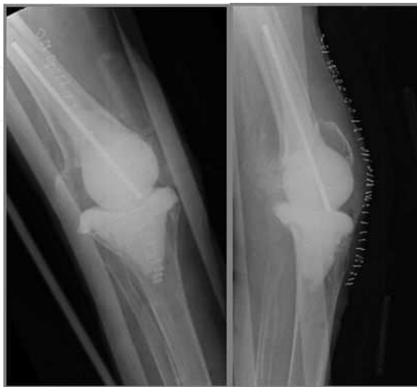
Figure 2. Ball and socket spacer.

reactions as a result of particle generation; however, this has not been considered a real problem in published series [18], [21], [24].