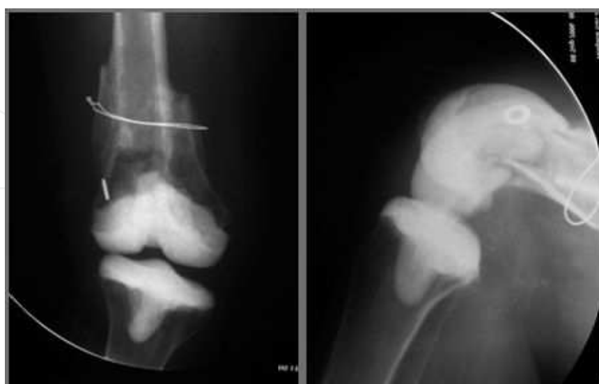
Figure 3. Hand-made spacer for a segmental defect. Excellent range of motion. Due to instability or giving way the patients usually walks with a brace.