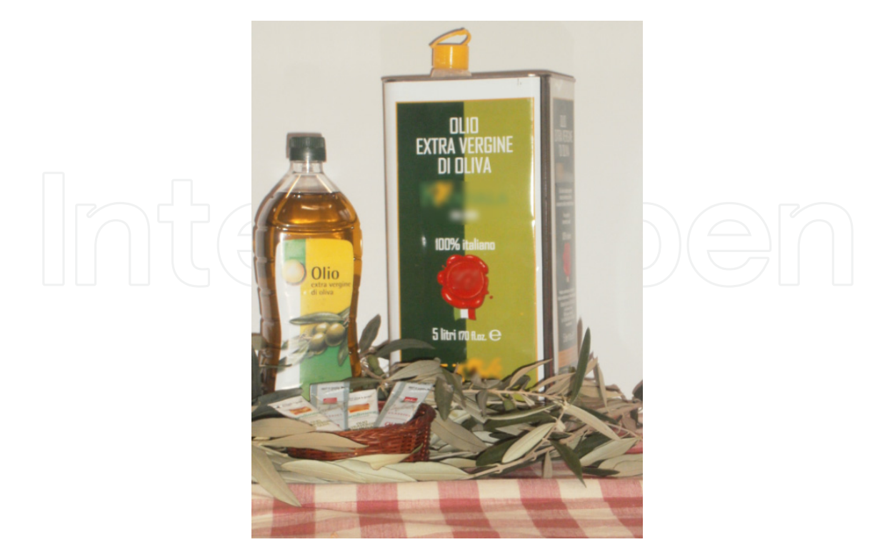
Figure 2. PET, tinplate and single-dose sachets as olive oil packaging

With the increase of container typologies and the research of more refined packaging in materials and graphic the supplementary cost merges into the final price that is, however, a product quality indicator (Paffarini, 2007).