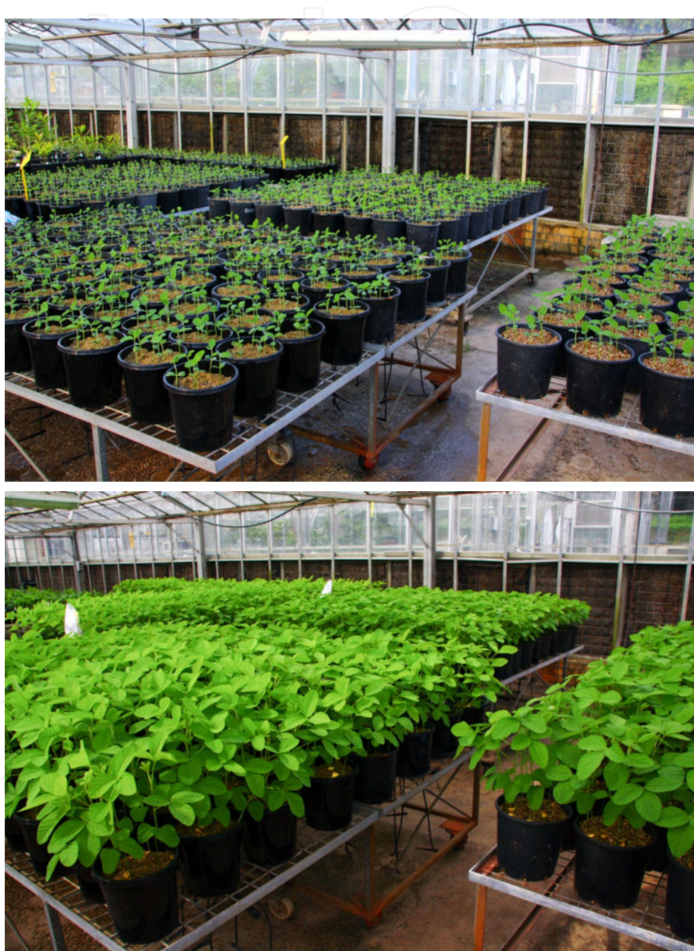
Figure 3. Glasshouse grown soybean plants 1 and 3 weeks after germination. The fast, uniform growth of soybean, together with the availability of its genome sequence and its amenability to most physiological, molecular and biochemical analyses makes it an ideal model species for legume research.

Silencing (VIGS) for functional genomics approaches ( e. g. , Zhang and Ghabrial, 2006). Furthermore, soybean has a large germplasm, including vast mutant (Figure 2; e. g. , Carroll et al., 1985; Bolon et al., 2011) and TILLING populations ( e. g. , Cooper et al., 2008; Batley et al., 2012).