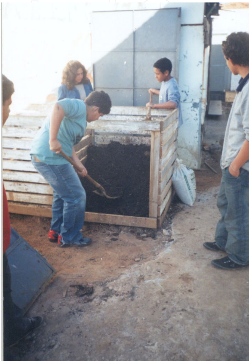
Picture 4. Composting in schools

This type of practical environmental education in schools takes the message to students' families and thus multiplies the result of landfill diversion. Picture 4 is provided to illustrate compost production by students as practical environmental education activity.