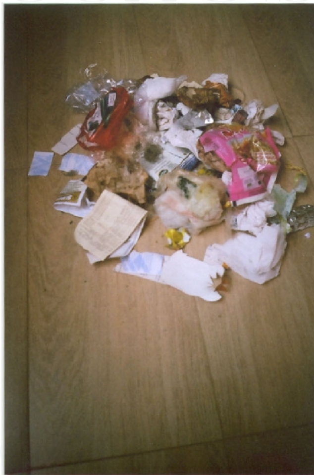
Picture 6. Trash to incineration

back for disposal, but people are always looking for the least effort solution. They would throw the used batteries into the refuse bag, which in the apartment receives non-recyclable items. One day, the administration took the initiative of providing a pail at the collection point in the building, especially for batteries. To the surprise of all concerned, that pail kept filling up with batteries at a rate of approximately two kg per month. With a very simple provision, the infrastructure stimulated source separation. This reaction has to be seen in its own context, of course. Had the people not been coached on source separation for a long time, they would not have responded to the provision of the new facility the way they did, which underlines the circular nature of the people game.