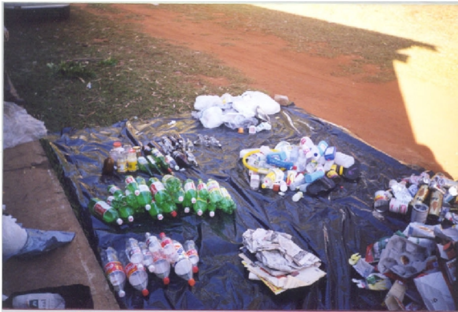
Picture 3. Dry waste sorting

years of coaching. This waste already came from the apartments in divided form. Before weighing, the routine check by building employees moved any items from the wrong bin into the right bin.