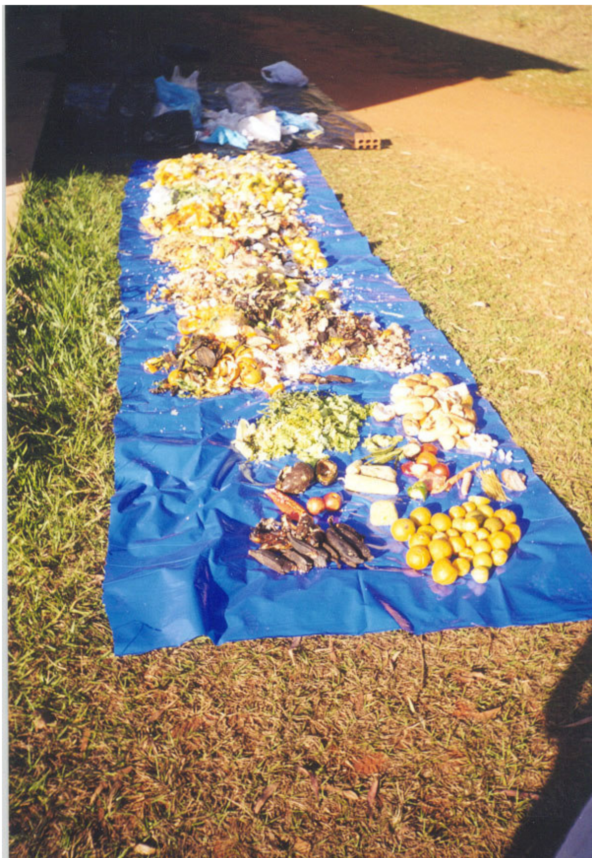
Picture 2. Bio-waste sorting