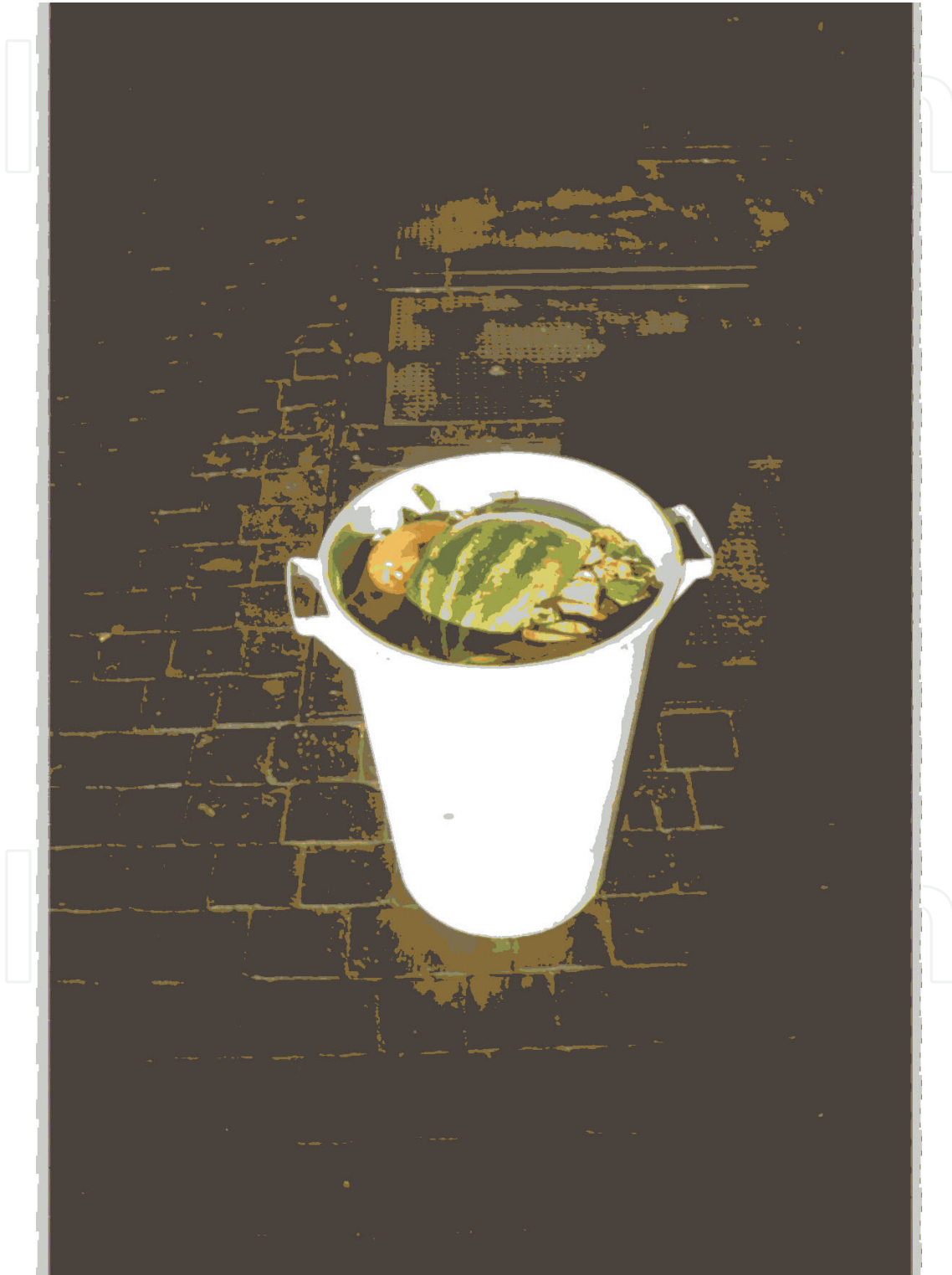
Picture 7. Sorted bio-waste ready for recycle

Pictures 7 and 8 are provided to illustrate how sorted waste is being offered to reverse logistics at the moment. The barrel seen in the background contains the 33% trash, which the city crew takes to the landfill. Upon comparing this situation to the starting point shown on Picture 1, the progress can be appreciated. It was slow, but it happened.