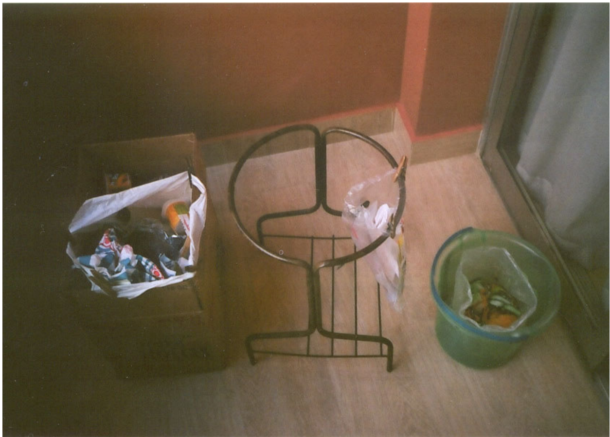
Picture 5. Modern source-separation

Two more pictures are provided here to illustrate the source separation procedure. Picture 5 shows the basic three recipients used in pioneering apartments for waste disposal, namely one each for bio-waste, for dry recyclable material and for non-recyclable trash. Picture 6 shows the typical contents of the small bag that receives the trash.