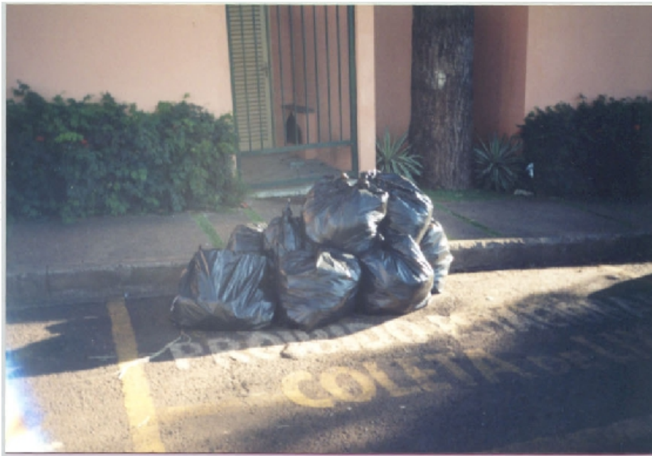
Picture 1. Classical plastic bag method of waste collection

As Table 2 predicts, this will continue until 2027 when top-down directives are expected to turn from tipping to recycling. From then on, the problem changes from managing waste into managing people. Level 4 of Table 1 will have to be specifically addressed. According to the theory of the management threshold mentioned earlier, sorted waste composition will become the all important parameter for setting recycling targets and developing the corresponding procedures. In order to prepare the approximation of levels 3 and 4 of Table 1 needed for successful planning, the research described here initiated the bottom-up direction of waste handling. The idea behind the method was to prepare people to accept and cope with the expected municipal legislation that eventually will make waste sorting at the source compulsory. The timeframe is sufficient for both sides to approach the meeting point. The municipal administration will develop and enact the bylaws, and the residents will practice source separation in anticipation of those bylaws, such that the transition will be rather swift.