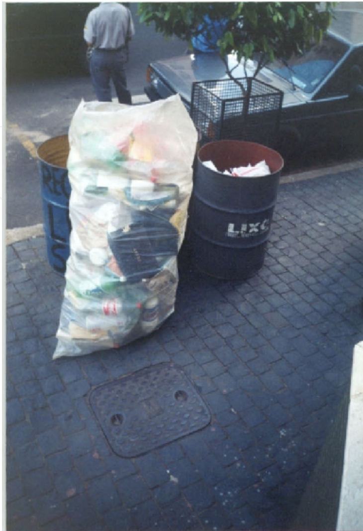
Picture 8. Sorted dry waste ready for recycle

Only a few families have so far reached this stage of perfect separation that eliminates the need for additional sorting by condominium employees and, above all, the need for collection by city crews. It is “zero waste” in the apartment, thanks to the condominium level infrastructure, and is the logical target for the rest of the families who are still hovering at 33% refuse. No utopia, only hard work.