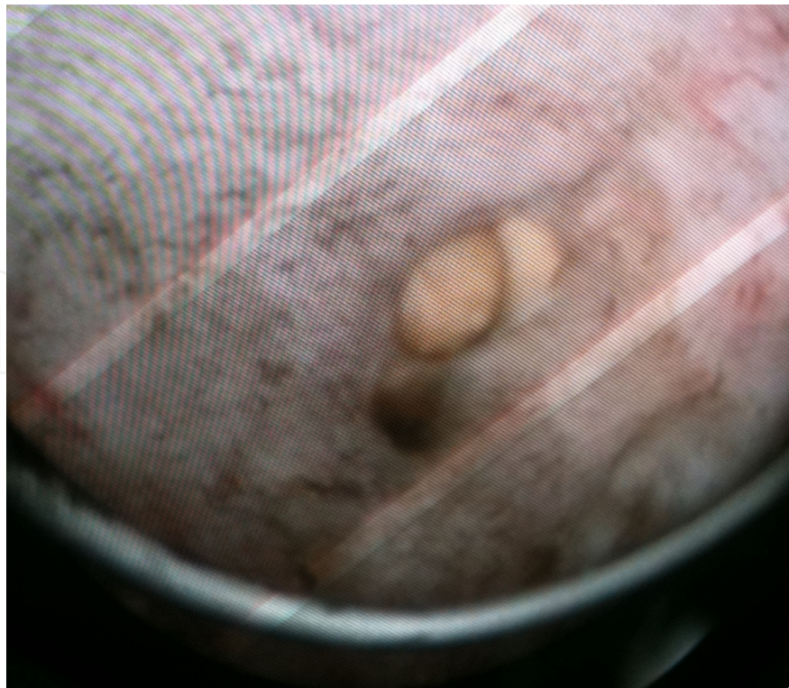
Fig. 4. Prostate stones encountered during TUR-P