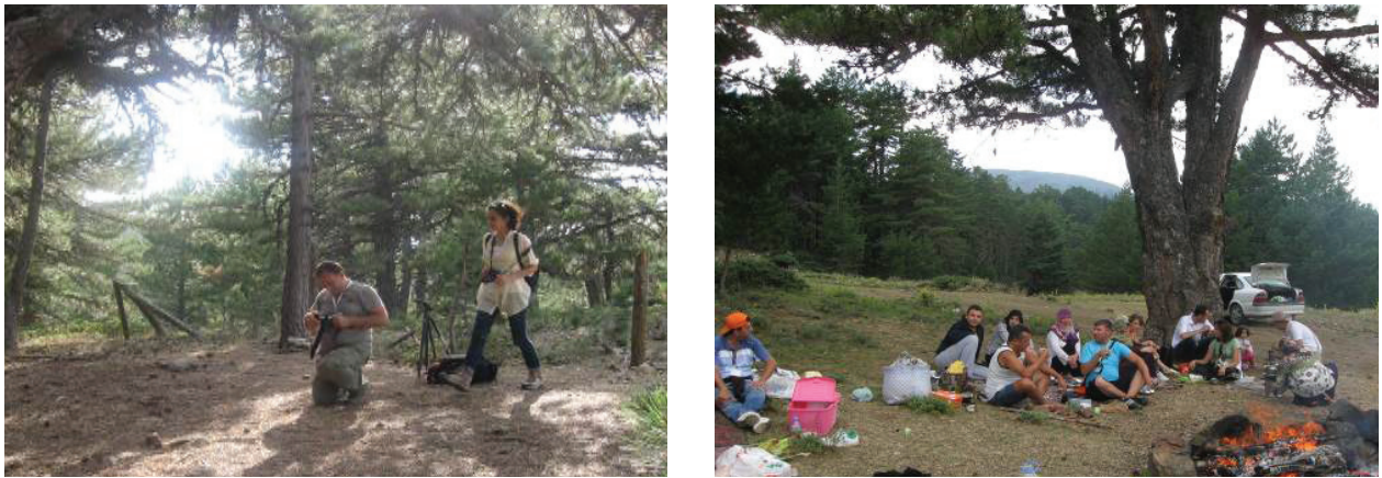
Figure 3. Nature photography and a picnic in Murat Mountain

Murat Mountain is also important for wildlife. Area suitable for hunting tourism nature. Spa 2 km far away from the speakers are producing farm lara. Murat Mountain animals are protected species of wildlife such as otter and badger includes monitoring and research opportunities. Murat Mountain rocks formed in different geological periods, a tourist attraction and has the geomorphologic structure of visual beauty. Geomorphology and geology is the structure of space-science education and as a practice field for the potential. Murat Mountain and around the village settlements on the plains there are under 1300 meters. Those of authentic village houses in the villages and settlements in the forest farm tourism, farm tourism and provide opportunities for activities such as examination of the traditional ways of life. At these locations, the tarhana soup unique to the region, Gediz kebab, halvah, bending an important food for the tourism sector are foods such as pancakes. In addition, local crafts and gift market of products of wood, embroidery products.