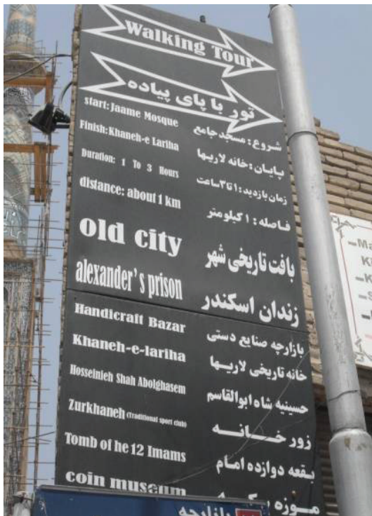
Fig 3. Walking Tour

scious architecture, a new architecture is appearing that is inconsistent with the climate of area. There are line houses madding up of concretes, irons and bricks. Their yard with short walls from one hand unable to make a suitable shadow, protect the buildings against strong winds and sunlight and on the other hand, using thin walls, ceilings and using bitumen on the roofs that because of darkness cause increasing temperature in summer and decreasing temperature in winter and finally using heater with fossil fuels and cooling machines used in different seasons. It can be said that the new architecture with unsuitable structure causes the residents' discomfort and with unfit construction materials it makes instability [15]. Figure 4 shows an old house in Yazd with an Air trap.