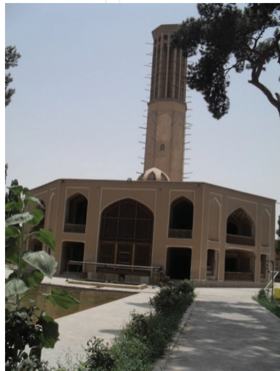
Fig 4. An old house in Yazd with an Air trap