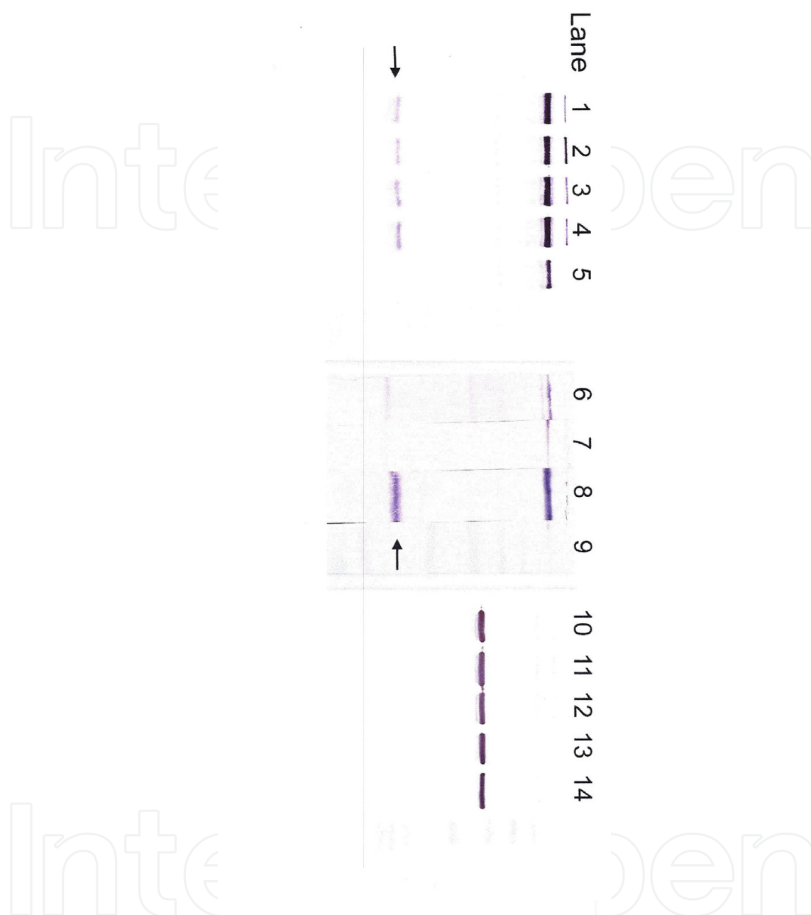
Figure 2. Demonstrates a series of experiments evaluating a 20 kD protein detected by anti-HER2 extracellular domain (AA 182-373) anti-sera at 48 hours. Lanes 1-5 demonstrate the full Western blot gel of BT-474 (48 hours, from Figure 1) showing two bands: the p185 HER2 protein and the 20 kD protein (arrow on left) lanes 1-4 . Note that this protein is not detected in lane 5 which represents lapatinib-treated cells, while the p185 HER2 is mildly reduced in lane 5 . Lanes 1-14 show the corresponding actin control confirming that equal numbers of cells were applied to lanes 1-5 . Exposing BT-475 cells to an acid wash of pH 4.0 does not elute the protein as lane 7 is the acid wash and the cell pellet that remains is shown in lane 6 , has both p185 and the 20 kD protein. Using the Triton X Perfect Focus Membrane Protein kit methodology shows a clearer picture of localization of the 20 kD band with membrane HER2 protein and the 20 kD band (arrow) both in lane 8 (membrane protein concentrate) and corresponding cell pellet, run in lane 9 , is negative.