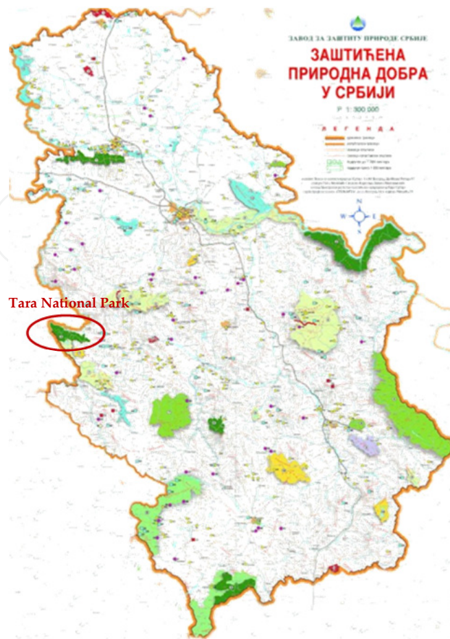
Figure 1. Map of natural protected areas in the Republic of Serbia, with the geographic position of Tara National Park