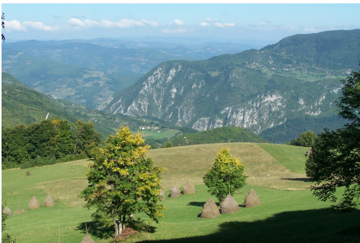
Figure 5. Landscape in Tara NP

Further on, when tourists were asked to answer why Mountain Tara was declared a national park, the obtained answers point out the fact that it is because of: 'untouched nature', 'beautiful scenery', 'preserved nature', 'rare and endangered plant and animal species', many of which mentioned Pančić's Spruce, 'rich wildlife', 'lakes' and 'forest' (Figure 5).