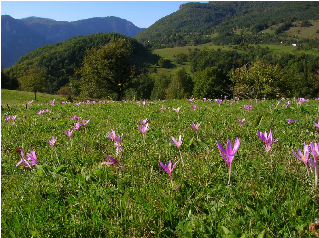
Figure 8. Beautiful scenery in Tara NP

because of which territory got the status of national park, comprehensive understanding of the nature is necessary (Figure 8.) [26].