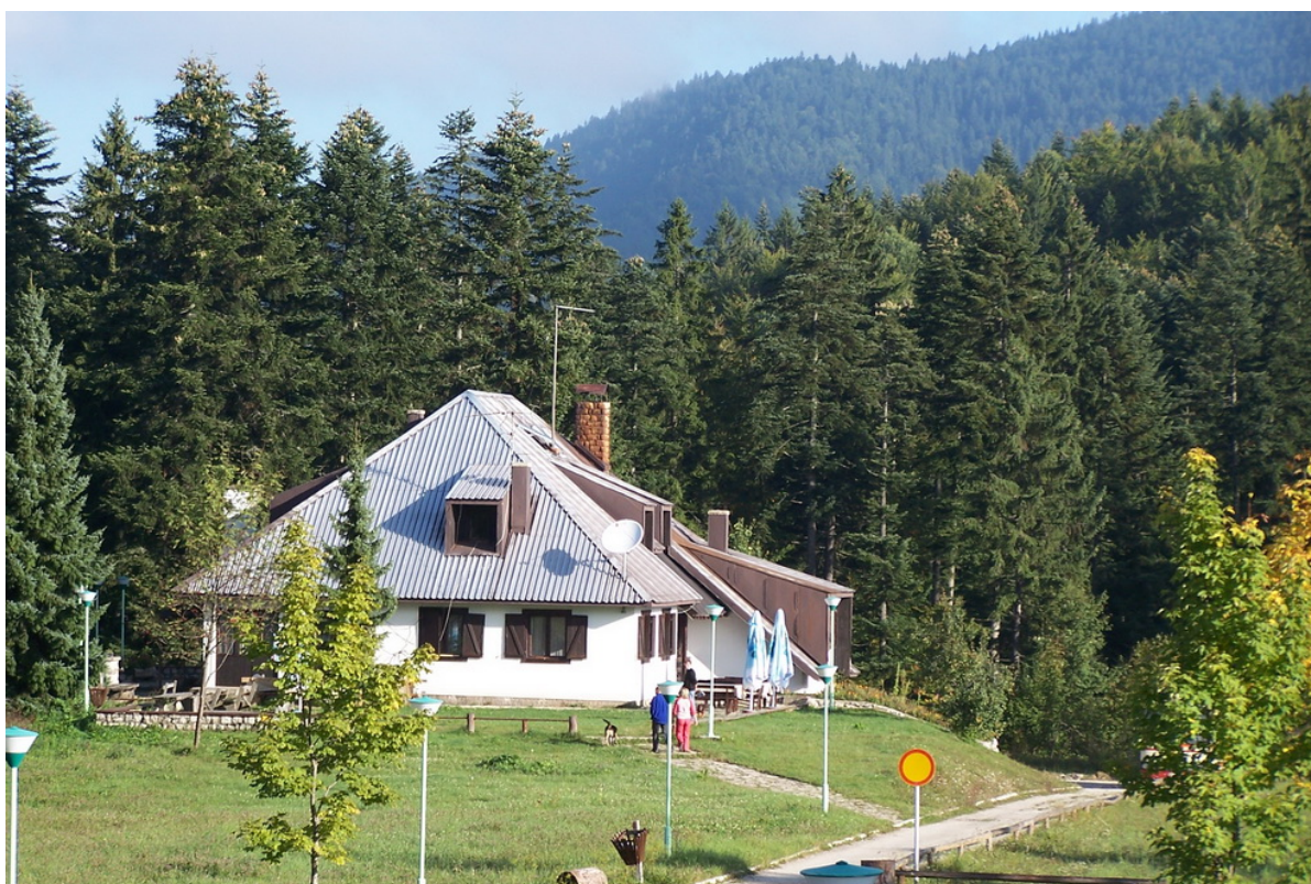
Figure 4. Predov krst – tourist centre in Tara NP