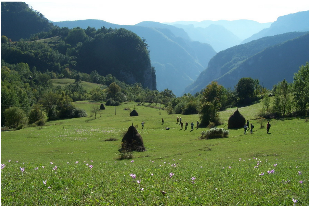
Figure 6. Tourists in Tara NP

The summarized results show that almost a third of the tourists interviewed was for the first time on Tara (30%) while, on the other hand, about a third of the respondents (26.7%), visited NP Tara for more than 4 times. The remaining number of the respondents visited Tara from 2 to 4 times. Among other things, the number of visits to the park has an influence on the creation of positive attitudes towards nature conservation; with an increasing number of visits the intensity of experience in nature also increases which then strengthens the relationship man-nature, or man- the environment and vice versa (Figure 6.).