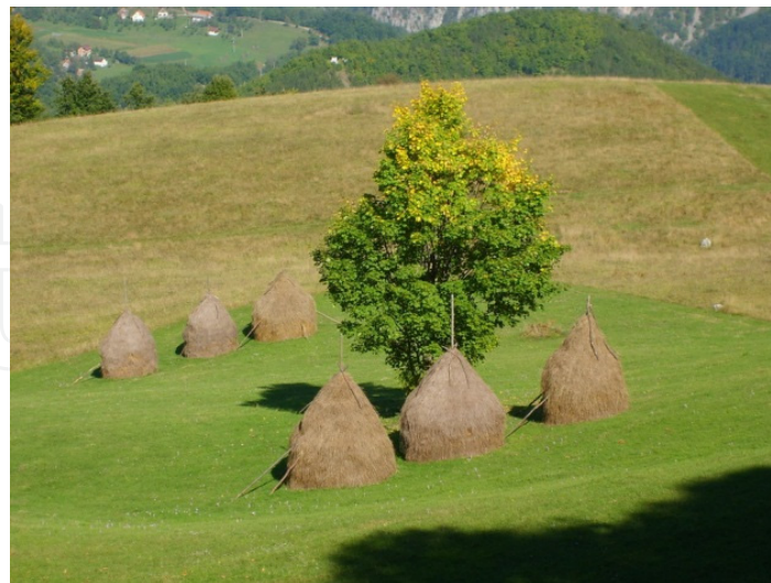
Figure 2. Meadows and pastures in Tara NP

Tara mountain range was formed more than 600 million years ago from Palaeozoic limestone and shales. Glacial and postglacial events played a significant part in determining the flora and fauna of this protected area. During the great ice age and the alternation of