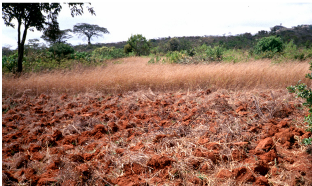
Figure 4. An uneroded part of the landscape within the Kondoa Eroded Area.

Sedimentation and sandiness of the soil was perceived as a problem by only a few farmers (see Figure 2). This response was particularly obtained from farmers whose fields laid in stabilising sandfans that have soils with very low organic matter levels, low moisture holding capacity and poor fertility status. Such soil characteristics are also common in other parts of the Irangi Hills, such as in Haubi and Mulua [1, 7]. Sedimentation was reported to take place in depositional footslopes and valley bottoms where the eroded materials from hillslopes accumulate. In many places sedimentation of sandy materials buried the former fertile clayey topsoil [1, 7]. One would expect this indicator to be mentioned by most respondents, however since farmers have had their settlements and fields in that kind of environment for generations they do not often mention it as a major concern. The explanation to this situation would be that soil erosion and sedimentation in this area dates long in history to the extent that very few benchmark areas remain that could show the earlier landforms not affected by sedimentation [7].