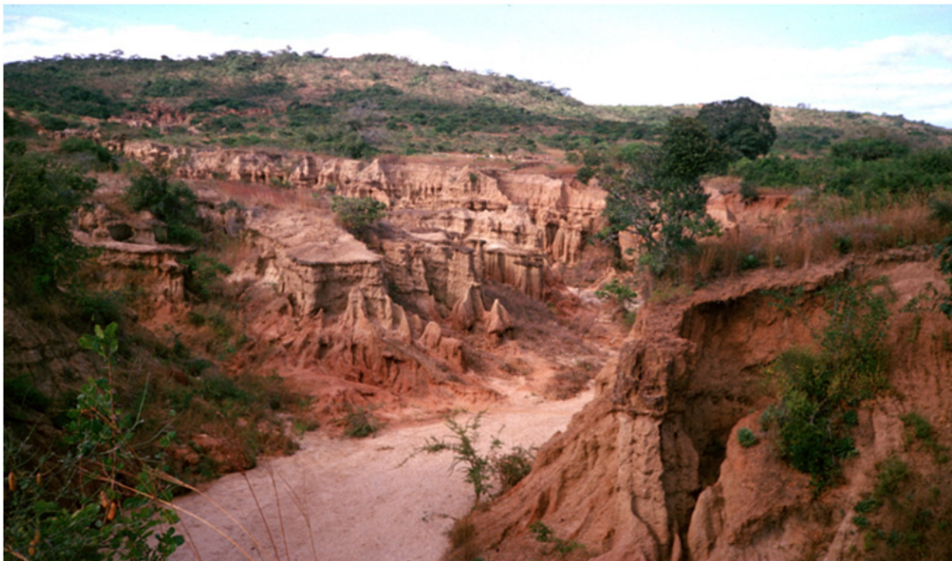
Figure 3. Gully erosion in the studied villages. This is a common feature of the landscape and in many parts of the Kondoa Eroded Area

Soil erosion and surface runoff featured as indicators of soil degradation as indicated by about 44% of respondent farmers (Figure 2). Awareness of soil erosion as a soil degrading process featured more prominently among Baura and Bolisa respondents. Visual observation of the landscape in these villages confirms the local people’s response. Both Baura and Bolisa have landscapes dissected by more pronounced gullies (Figure 3) compared to Mafai village (Figure 4). Discussions with key informants in these villages indicated that historically the two villages had large numbers of livestock prior to destocking in 1979 that rendered many places devoid of vegetation because of overgrazing. This situation exposed the land surface to agents of soil erosion, such as runoff. The extensive gullies seen today in these and many other villages in the Irangi Hills are said to have formed along former cattle tracks aligned down the slope [6].