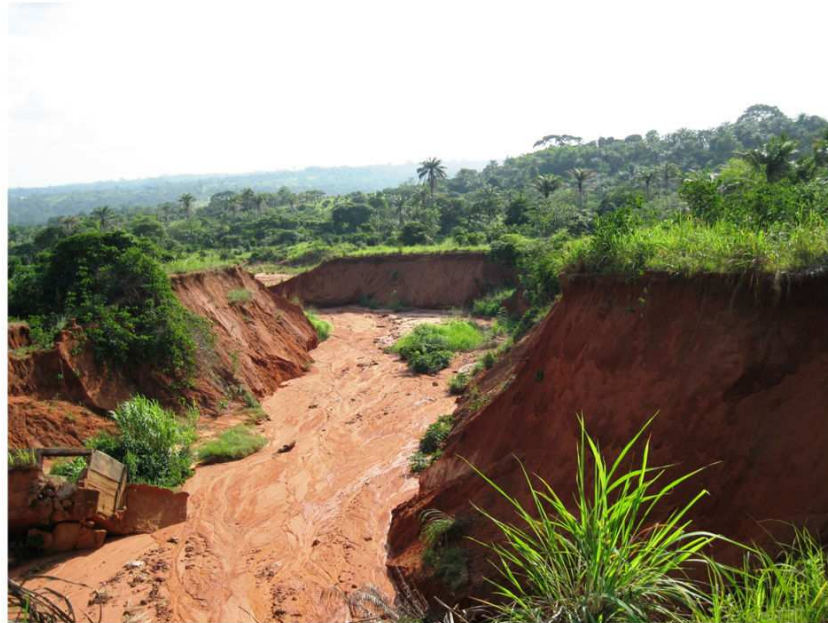
Figure 2. Typical gully site

sis and location of this particular gully site on the landscape is similar to numerous other gully sites in the region.