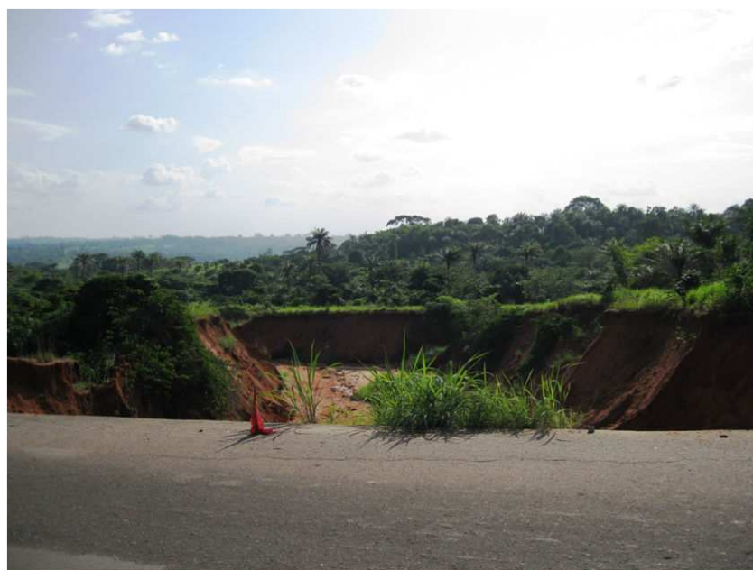
Figure 5. Gully about cutting an asphalt surfaced road

An important factor which contributes significantly to soil erosion problem in southern Nigeria is anthropogenic influence arising from misuse of land. Poor farming systems have contributed to collapse of soil structure and thus encouraging accelerated runoff and soil loss due to erosion. In the event of uncontrollable grazing caused by the nomads has resulted in deforestation of the landscape while indiscriminate foot paths created on the landscape has helped the incipient channels on the landscape to form. These channels eventually metamorphose to gullies especially when they are not checked at inception. Road constructions including uncontrolled infrastructural developments have contributed significantly in gully developments. Some road networks under construction have been abandoned in the region due to gully formation.