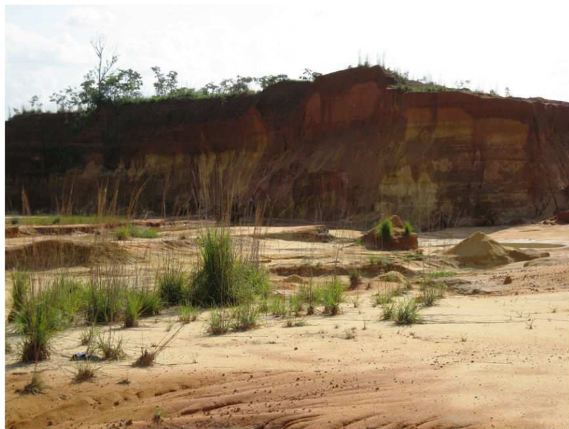
Figure 4. Gully site in association with interill and rill erosion

Again other soil properties encourage structural failure, sliding and mass movement of soils. These soil factors are the mineralogy of the clay and even the soil chemical properties. The stability of the soil mass is therefore depended on the clay minerals present. Illite and smectite more readily form aggregates but the more open lattice structure of these minerals and the greater swelling and shrinkage which occur on wetting and drying render the aggregates less stable than those formed from kaolinite. Soils in which either kaolinite or illite clay predominates but contains small amounts of smectite are easily dispersive. Smectitic soils are more erodible than the soils that contain only small amount of smectite. Conversely, soils that do not contain smectite are more stable, less erodible and less susceptible to seal formation.