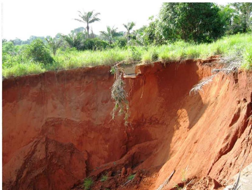
Figure 3. Gully cutting

clay content, level of soil organic matter (SOM) and sesquioxides such as Al and Fe oxides, clay dispersion ratio (CDR), mean-weight diameter (MWD) and geometric-mean weight diameter (GMD) of soil aggregates all influence soil erosion hazards in southeastern Nigeria. SOM, Al and Fe oxides control dispersion and flocculation of the soils. In the event of very aggressive rainfall, the soil inherent properties often combine with the physical forces of rainfall to produce soil erosion in the soils.