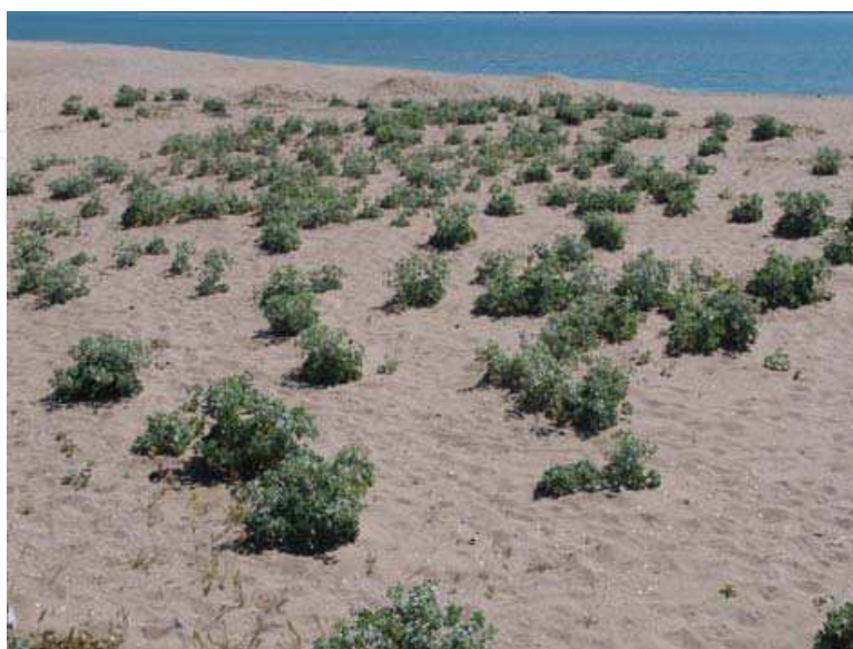
Fig. 6. Eryngium maritimum .