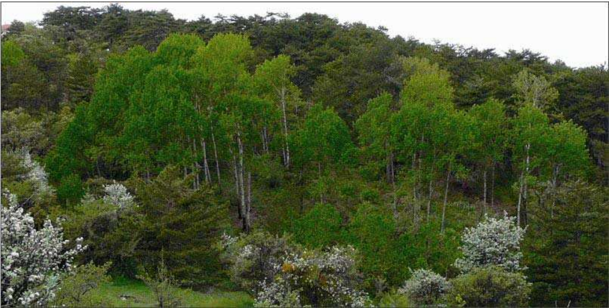
Fig. 3. The Yozgat Pine Grove National Park, Turkey ( www.milliparklar.gov.tr ).

The first national park in Turkey was established in 1958 ( The Yozgat Pine Grove National Park ) (Figure 3). Some of these parks, which were initially established for archaeological and historical purposes, are at the same time rich habitats where biological diversity is being protected.