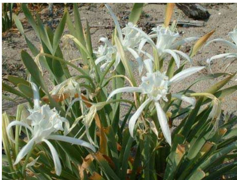
Fig. 10. Pancratium maritimum .

There are three longos forests in the area. The conserved natural longos forests in the study area are the Lake Mert longos (316 ha), Lake Erikli longos (456 ha), and Lake Saka longos (624 ha) forests (Figure 11-13) This type of ecosystem is unique and rare in Turkey and the world because these ecosystems are sensitive to environmental conditions. In general, deciduous mixed forest vegetation is found in the area outside of the longos forests, and in this area the forests have similar floristic composition to the longos forests. However, slopes are rather steep in the area where these forests are found, and therefore the water table is well below the surface. The different ecosystems in the area provide a diverse living environment for the fauna in the region. Nearly half (194) of the 454 bird species constituting the bird diversity of Turkey are seen in this area during the year (Özyavuz and Yazgan, 2010).