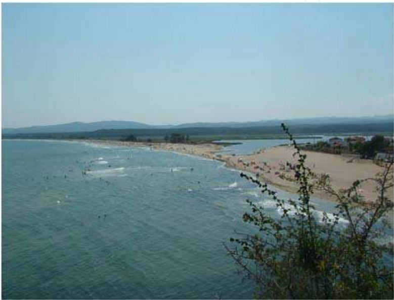
Fig. 4. General view of this area.

The İgneada Longos Forests National Park, located on the Black Sea coast 15 km from the Turkish-Bulgarian border, is positioned between the northern latitudes 41° 44' 43" and 41° 58' 27" and the eastern longitudes 27° 44' 52" and 28° 3' 17". The İgneada area includes different kinds of ecosystems (sand dunes, wetlands, longos (flooded alluvial) forests, deciduous forests, and many streams) and a wide range of biodiversity; these characteristics make it one of the most important areas in Turkey (Ozyavuz, et al., 2006) (Table. İgneada and the surrounding environment have unique characteristics; these types (İgneada Longos Forests) of wild forest in other parts of Turkey and in Europe have been damaged due to anthropogenic effects (Figure 4).