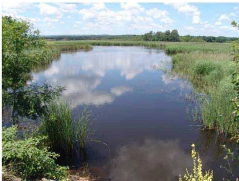
Fig. 12. Lake Erikli.