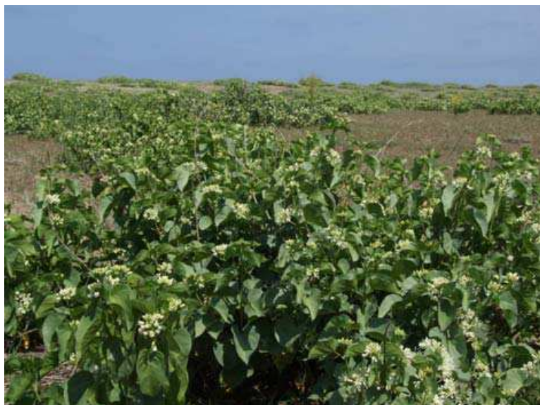
Fig. 5. Cianura erecta .

There are five lakes in the area. Lake Erikli Lagoon (43 ha) is adjacent to the northern part of Igneada subdistrict, which is not linked with the sea during the summer period. Lake Mert (266 ha) is located at the southern part of the subdistrict, where the stream reaches the Black Sea. Lake Saka, which is the smallest (5 ha), is at the southernmost part of the study area between the forest and sand. Lake Hamam (19 ha) and Lake Pedina (10 ha) are located in the inner part. The coastal dunes and the longos forests of Igneada constitute the most sensitive ecosystem in the study area. Most of the known endemic plants ( Silene sangaria , Crepis macropus , Centaurea kilaea ) in Igneada and its vicinity are found in the coastal dunes; other species found here, though not endemics, are of national and international concern ( Aurinia uechtritiziana , Cakile maritima , Cionura erecta , Crambe maritima , Cyperus capitatus , Elymus elongatus subsp. elongatu , Eryngium maritimum , Euphorbia peplis , Eu. paralias , Jurinea kilae , Leymus racemosus , Otanthus maritimus , Pancratium maritimum , Peucedanum obtusifolium , Stachys maritima ) (Figure 5-10) (Özyavuz and Yazgan, 2010).