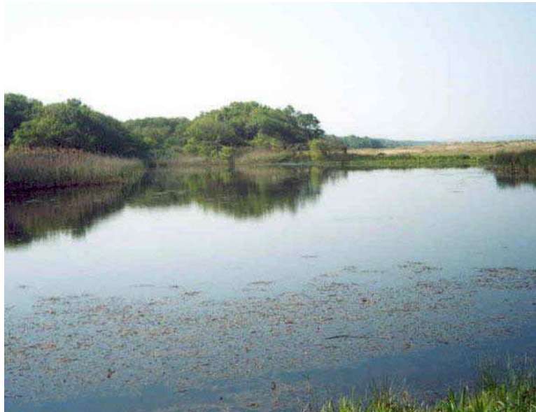
Fig. 13. Lake Saka.