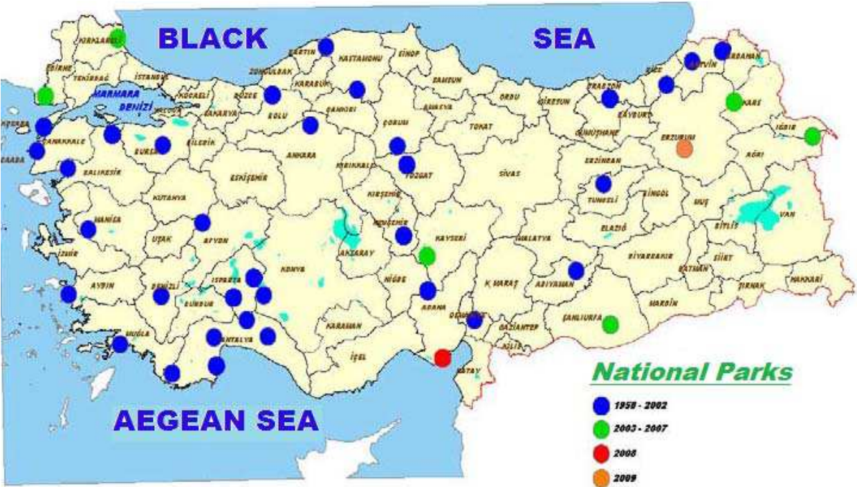
Fig. 2. National parks in Turkey.

The first national park in Turkey was established in 1958 ( The Yozgat Pine Grove National Park ) (Figure 3). Some of these parks, which were initially established for archaeological and historical purposes, are at the same time rich habitats where biological diversity is being protected.