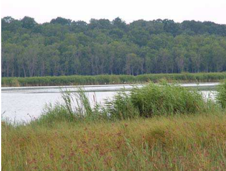
Fig. 11. Lake Mert.