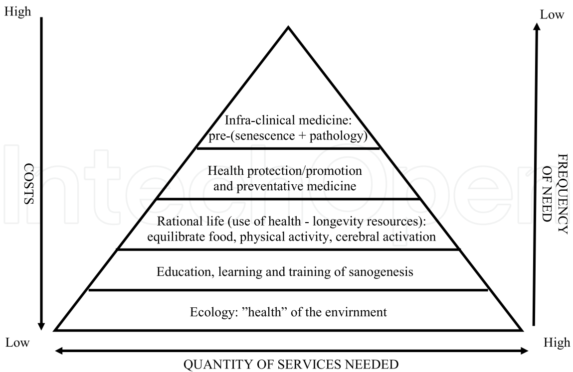
Fig. 4. New pyramid of (mental) health services. Advanced paradigm in (mental) health - longevity services (2009)