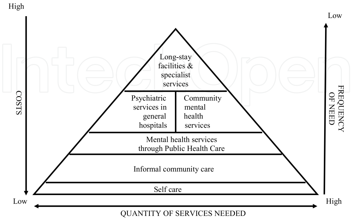
Fig. 3. Modern pyramid of (mental) medical services. Optimal mix recommended by WHO (2007)