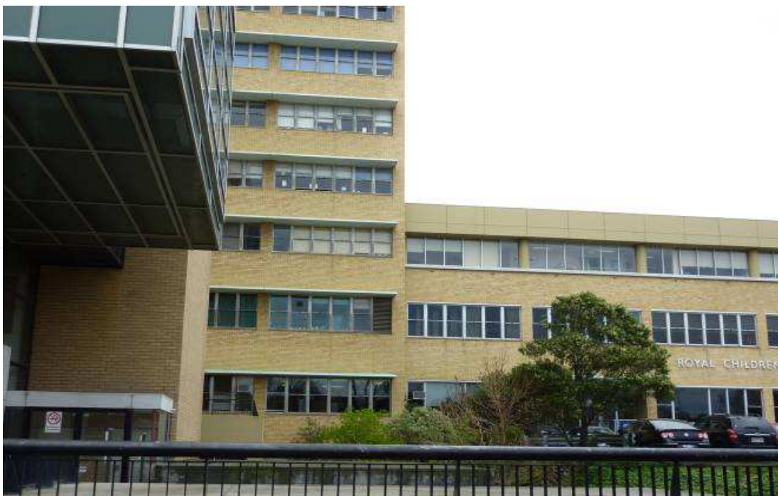
No sign (week 9)