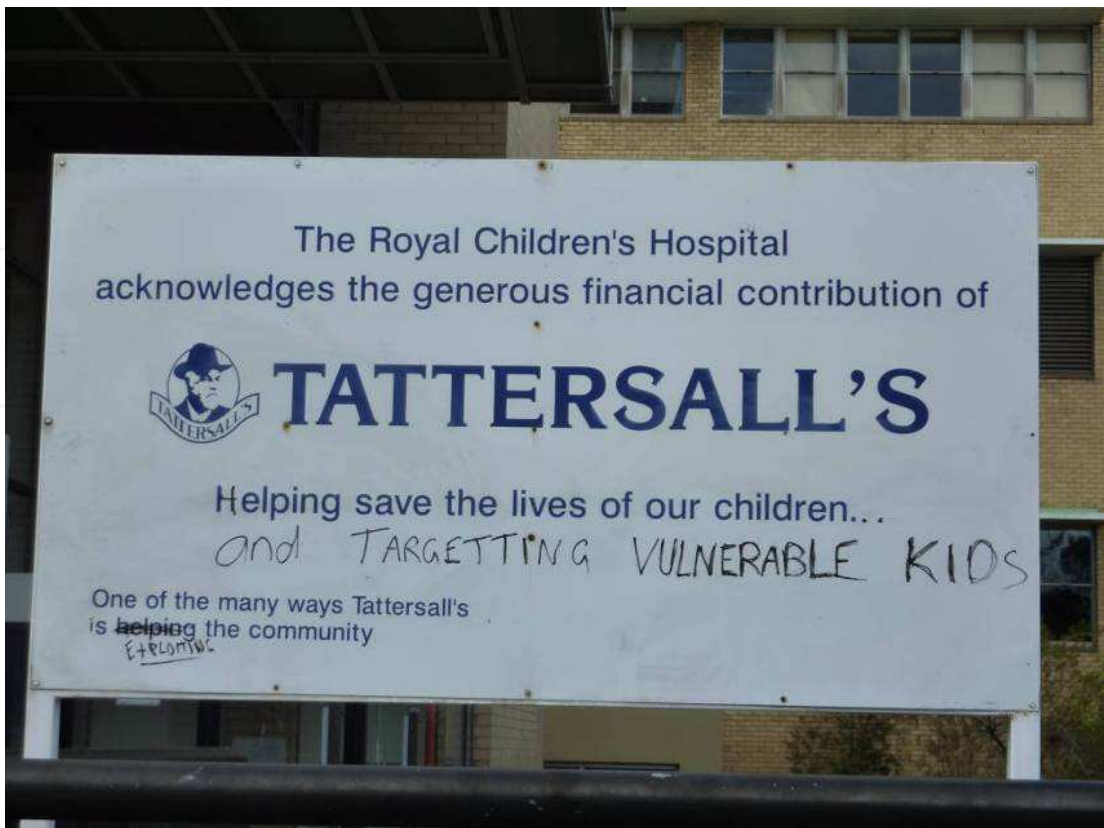
Graffiti on the sign week 2