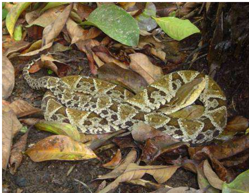
Fig. 1C. Bothrops asper from Costa Rica. Photo: Mahmood Sasa. From Gutiérrez et al. (2006) PLoS Medicine 3: e150.

In addition, some species, albeit not causing high numbers of bites, are capable of inflicting severe envenomings, such as Lachesis sp (bushmaster) and Micrurus sp (coral snakes) in the Americas (Warrell, 2004), Atractaspis sp (borrowing snakes) and Dendroaspis sp (mambas) in Africa/Middle East (WHO, 2010b), and a variety of elapid species in Australia and Papua New Guinea (White, 2010). Envenomings by colubrid species are usually not severe although fatal cases by species of the African genera Dispholidus and Thelotornis have been described (Warrell, 1995b). The taxonomy of venomous snakes is a highly dynamic field and recent modifications have been introduced in medically-relevant snake taxa (Quijada-Mascareñas & Wüster, 2010). Toxinologists, clinicians and antivenom manufacturers should be aware of these changes in taxonomy. Detailed information on the country distribution of the most important poisonous snakes is available at the WHO website http://apps.who.int/bloodproducts/snakeantivenoms/database/