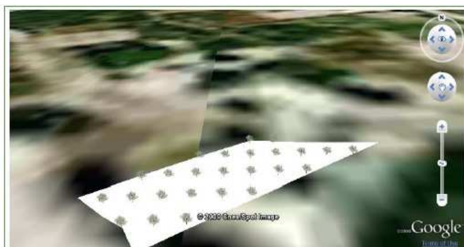
Fig. 5. Location of trees in a parcel and selected model.

parcel or just a section, where the user can fly virtually into the trees, “walk” between them or make visualizations within a wider context.