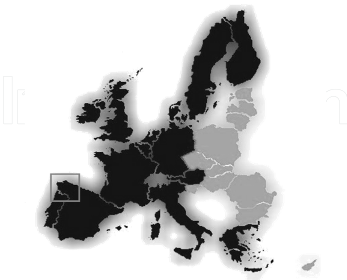
Fig. 1. Location of Galicia in Europe and Spain

regarding these types of activities. These initiatives are going to depend on the DSS problem-solving capacity.