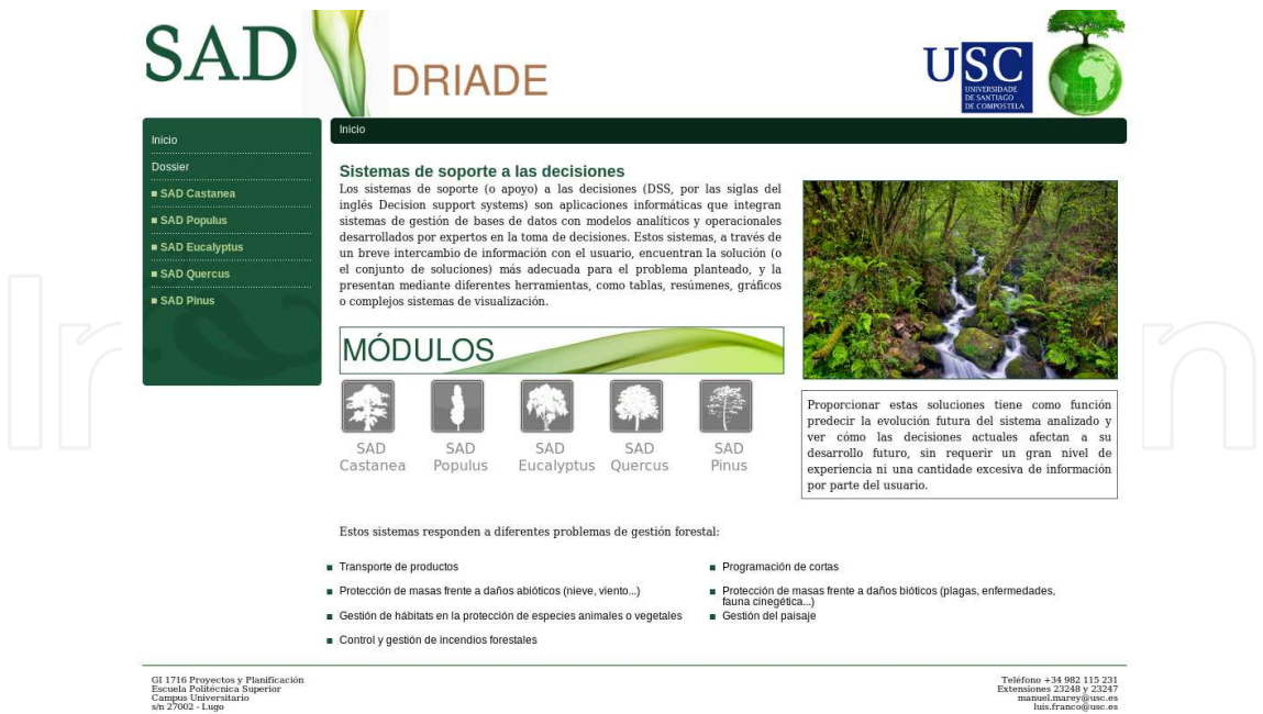
Fig. 2. SaDDriade initial screen.

After the basic characteristics of the model are presented, some parameters that influence the task development and performance of the chosen model are shown: Characteristics of the place: slope, percentage of rocks, stone content, soil type; Initial state of vegetation: type, height, density and presence of stumps; Management alternatives: choice between base-root