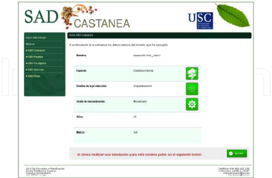
Fig. 3. Characteristics of a selected model.

After the basic characteristics of the model are presented, some parameters that influence the task development and performance of the chosen model are shown: Characteristics of the place: slope, percentage of rocks, stone content, soil type; Initial state of vegetation: type, height, density and presence of stumps; Management alternatives: choice between base-root