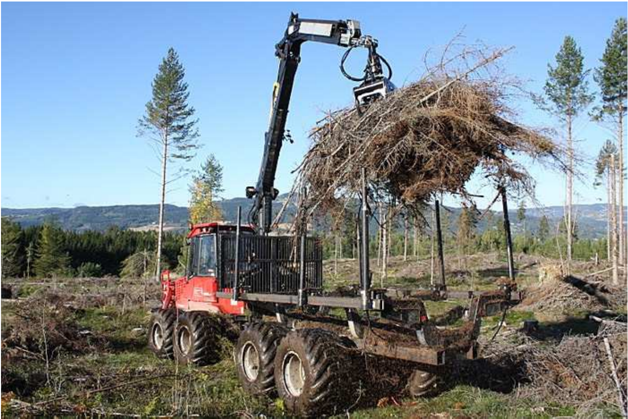
Fig. 2. Removal of a pile of branches and tops six months after harvesting, Gaupen, Norway

There is some concern that piling of branches and tops might increase the risk for pest outbreaks, in contrast to direct removal of these residues after harvesting or chipping on-site. However, compared to SOH, piling, if carried out before insect colonisation, might even reduce the risk for outbreaks because larger amounts of wood (on the insides of the piles)