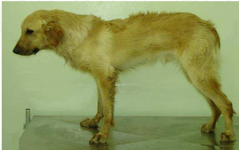
Fig. 1. Golden Retriever muscular dystrophy dog (GRMD model). (Ambrosio et al. 2009)

miniature (Paola et al., 1993), Weimaraner (Baltzer et al., 2007), and Boston Terrier (Deitz et al., 2008). GRMD dogs closely resemble DMD patients in terms of both body weight and in the pathological expression of the disease (Collins & Morgan, 2003). However, their phenotype is variable (Banks & Chamberlain, 2008), as some pups survive only for a few days, while others are ambulant for months or even years (Ambrosio et al., 2008). Animal trials employing these dogs have substantial animal welfare implications and high costs associated with both maintenance and treatment (Nakamura & Takeda, 2011).