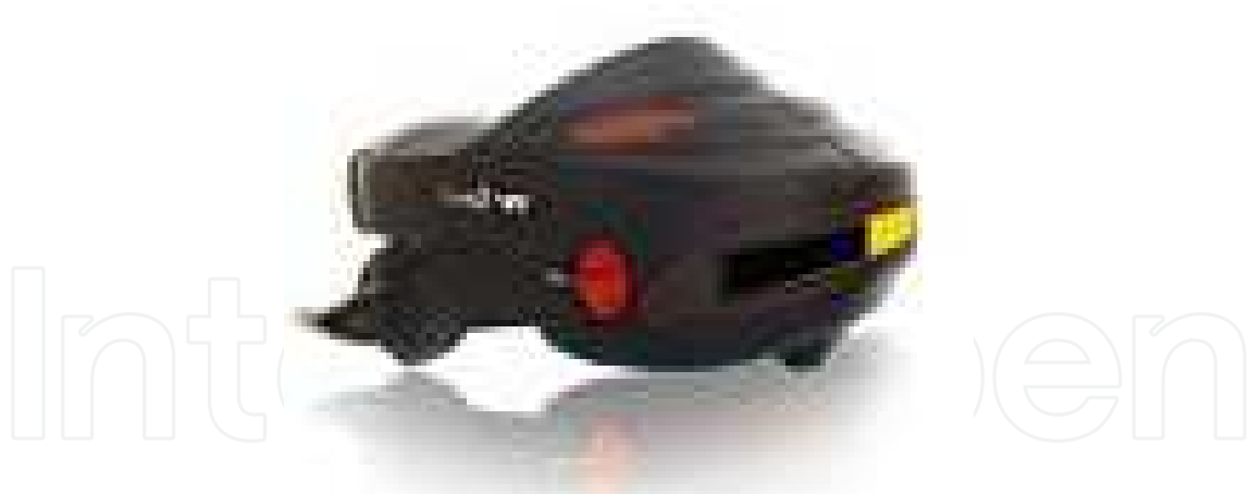
Fig. 1. Visette 45 SXGA head mounted display (HMD)

Small CRT head mounted display uses two CRTs that are positioned on the side of the HMD. Mirrors are used to direct the scene to the viewers' eye. Unlike the projected HMD where the phosphor is illuminated by fiber optic cables, here the phosphor is illuminated by an electron gun as usual (Lane, 1993). CRT head mounted display is in many ways similar to the projected HMD. This type of HMD is heavier than most other types because of added electronic components (which also generate large amounts of heat). The user wearing this type of HMD may feel discomfort due to the heat and the weight of the HMD (Bolas, 1994).