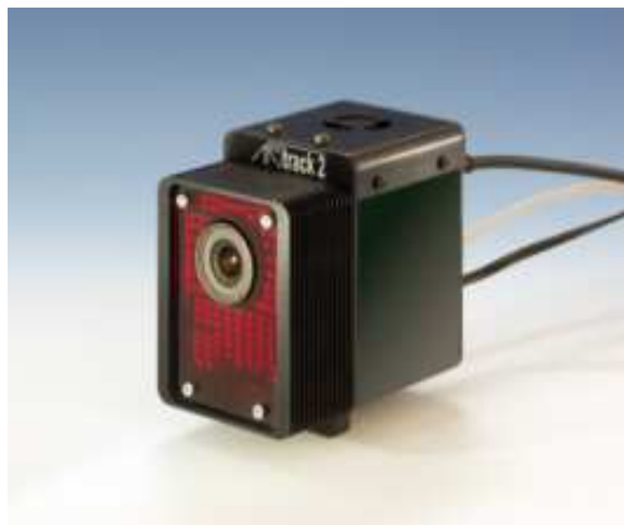
Fig. 4. A.R.T. optical tracking system

A mechanical tracker is similar to a robot arm and consists of a jointed structure with rigid links, a supporting base, and an “active end” which is attached to the body part being tracked (Sowizral, 1995) often the hand. This type of tracker is fast, accurate, and is not susceptible to jitter. However, it also tends to encumber the movement of the user, has a restricted area of operation, and the technical problem of tracking the head and two hands at the same time is still difficult.