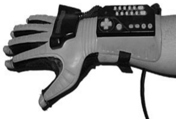
Fig. 5. An instrumented glove (Nintendo power glove)

Dataglove is a neoprene fabric glove with two fiber optic loops on each finger. Each loop is dedicated to one knuckle and this can be a problem. If a user has extra large or small hands, the loops will not correspond very well to the actual knuckle position and the user will not be able to produce very accurate gestures. At one end of each loop is an LED and at the other end is a photosensor. The fiber optic cable has small cuts along its length. When the user bends a finger, light escapes from the fiber optic cable through these cuts. The amount of light reaching the photosensor is measured and converted into a measure of how much the finger is bent (Aukstakalnis & Blatner, 1992). Dataglove requires recalibration for each user (Hsu, 1993). Fatigue effects and recalibration during a session are problems associated with long term use of Dataglove (Wilson & Conway, 1991).