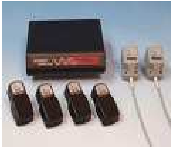
Fig. 3. Patriot wireless electromagnetic tracker