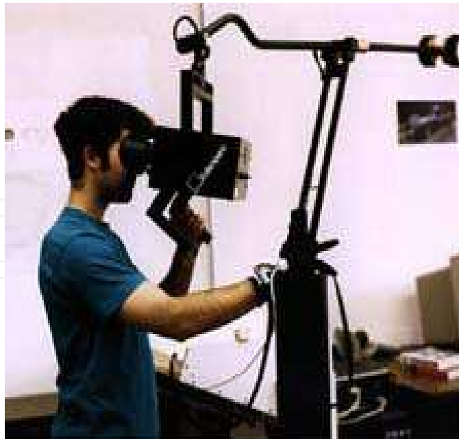
Fig. 2. A binocular omni-orientation monitor (BOOM)