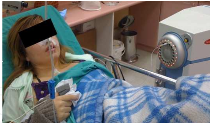
Fig. 1. Varisource Brachytherapy equipment (patient with a catheter in airway during treatment)