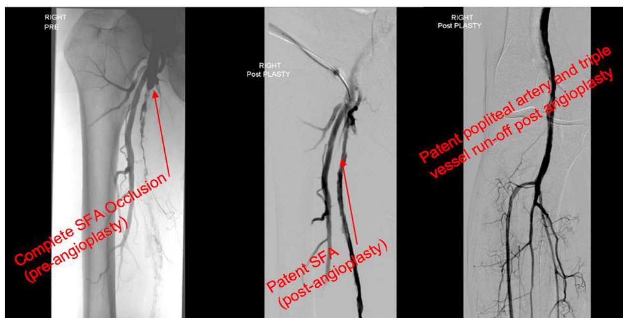
Fig. 2. Successful 5mm subintimal balloon angioplasty of an occluded superficial femoral artery of a 65 yr old male.

Open surgical interventions include endarterectomy which involves opening up the diseased artery and removing the atherosclerotic plaque to restore blood flow. With severe long segment disease a bypass procedure can be performed, such as a femoral-popliteal bypass for an occluded superficial femoral artery or an aorto-bifemoral bypass for occlusive iliac disease. Endogenous graft material is significantly more superior to exogenous synthetic grafts with significantly better 5 year patency rates. The long saphenous vein or cephalic vein are the most commonly used vessels for endogenous grafts.