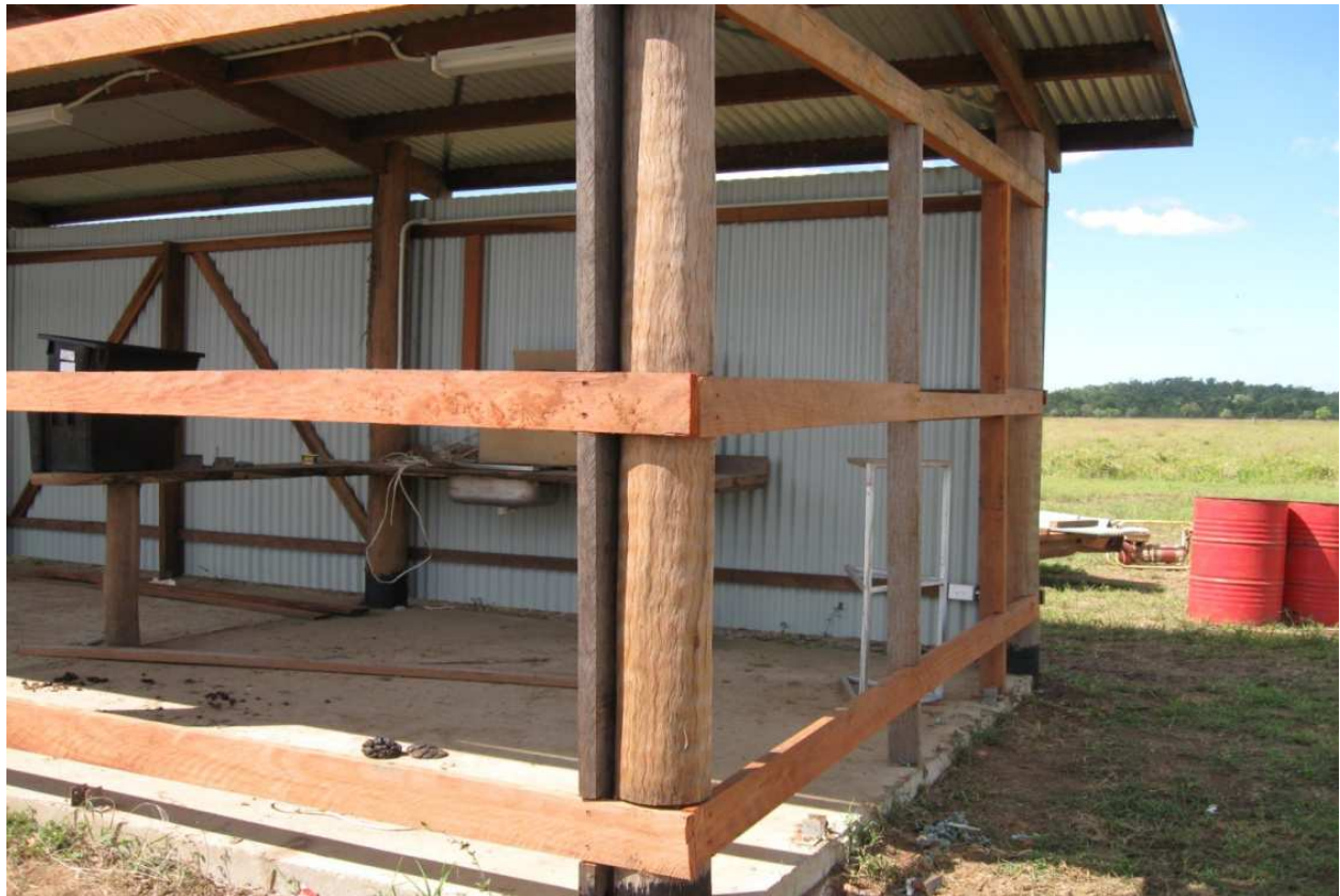
Fig. 4. The Kitchen Unit Showing Construction of Traditional Log Columns and Milled Timber Girts

five room bunk house, is illustrated in Figure 5. The leader of the Gumatj clan, Mr Galarrwuy Yunupingu AM, who had been Chairman of the prestigious Northern Land Council for over two decades, was able to use his extensive industrial and business network to acquire the assistance of three leading Tasmanian Corporations; University of Tasmania, Forestry Tasmania, and Fairbrother Builders. The architectural School of the University of Tasmania designed a timber structure of standard section structural timber with minimal employment of other construction materials. For instance, steel galvanised footings (for white ant protection), and plywood bracing gussets (to reduce the need for steel brackets) were the main off site structural non local timber components used in the building. Forestry Tasmania provided the initial supervision of two Lucas mill teams (six Yolngu men) and training in sustainable timber harvesting and management (four Indigenous men). Fairbrother Builders, a specialist company in building and construction, provided non Indigenous personnel (two men) to supervise the 18 Gumatj workers who built the bunk house. The 20 tonnes of timber used to build the bunk house was produced by another team of 10 Yolngu men who felled the trees and milled the logs.