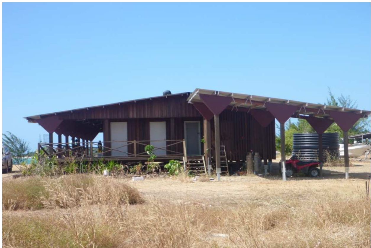
Fig. 8. The Completed Dhanaya House