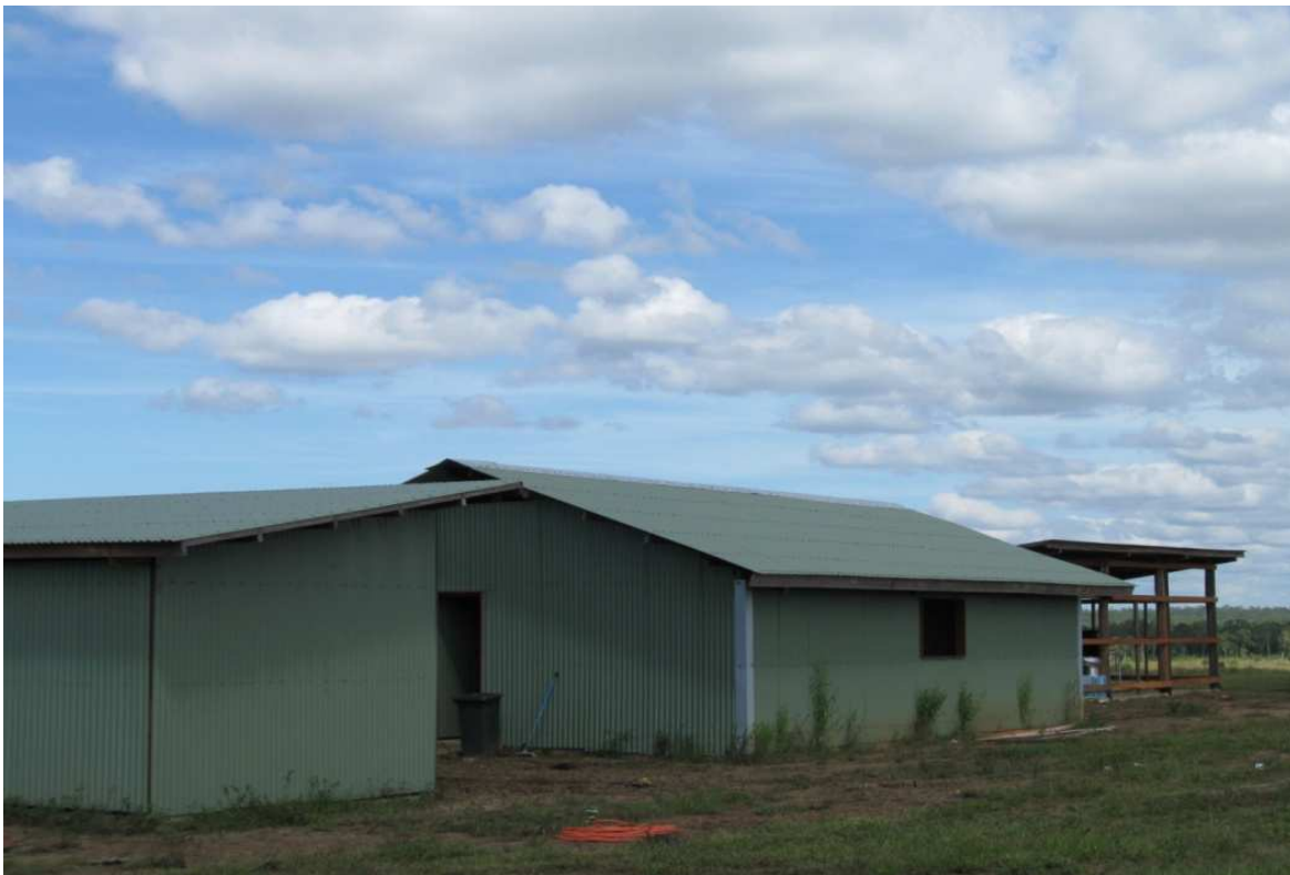
Fig. 3. The Garrathiya Dormitory and Outbuildings during Construction

In 2009 a second accommodation dwelling, architecturally designed to Western standards was built. This structure (14.6 metres x 15 metres), commonly referred to as the Garrathiya