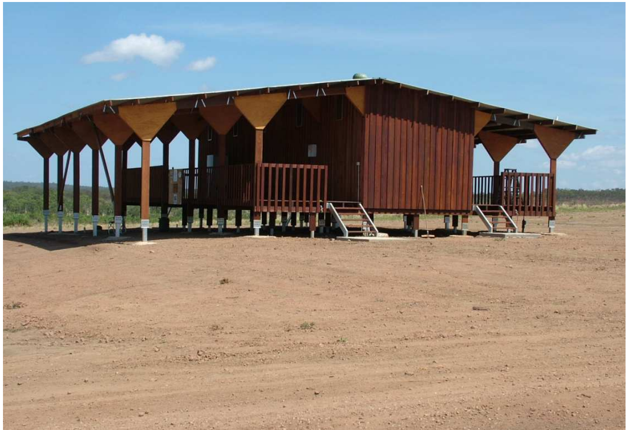
Fig. 5. The Garrathiya Five Room Bunkhouse

decking was transported to Gunyangara where it was dressed (by a third team), and then conveyed to the building site without delaying the erection progress. The design of the bunk house incorporated roof bracing to cyclonic wind standards, and to further accommodate the tropical climate other features included an overhanging roof to create shade on both side verandahs. Despite there being an absence of a time line chart to gauge the rate of progress the bunk house was built to an exceptionally high standard in a relatively short period (Pearson & Helms, 2010a). Both authors were at the site on the morning of the 25 th April 2009 when the first footing was set in concrete, and again on the morning of 7 th August 2009 when the dwelling was officially opened. This ceremony was attended by reporters of local and national newspapers, government officials, politicians (Territory and Federal), representatives of the project partners (Mr Jack Thompson; Mr Bob Gordon, Managing Director of Forestry Tasmania; University of Tasmania; Fairbrother Builders), Mr Galarrwuy Yunipingu, and a contingent of Yolngu men, who through their collaborative efforts had built the bunk house. Not only was it a magnificent achievement, but this was the first contemporary architectural designed timber dwelling that had been built by the Gumatj clan members on their ancestral land.