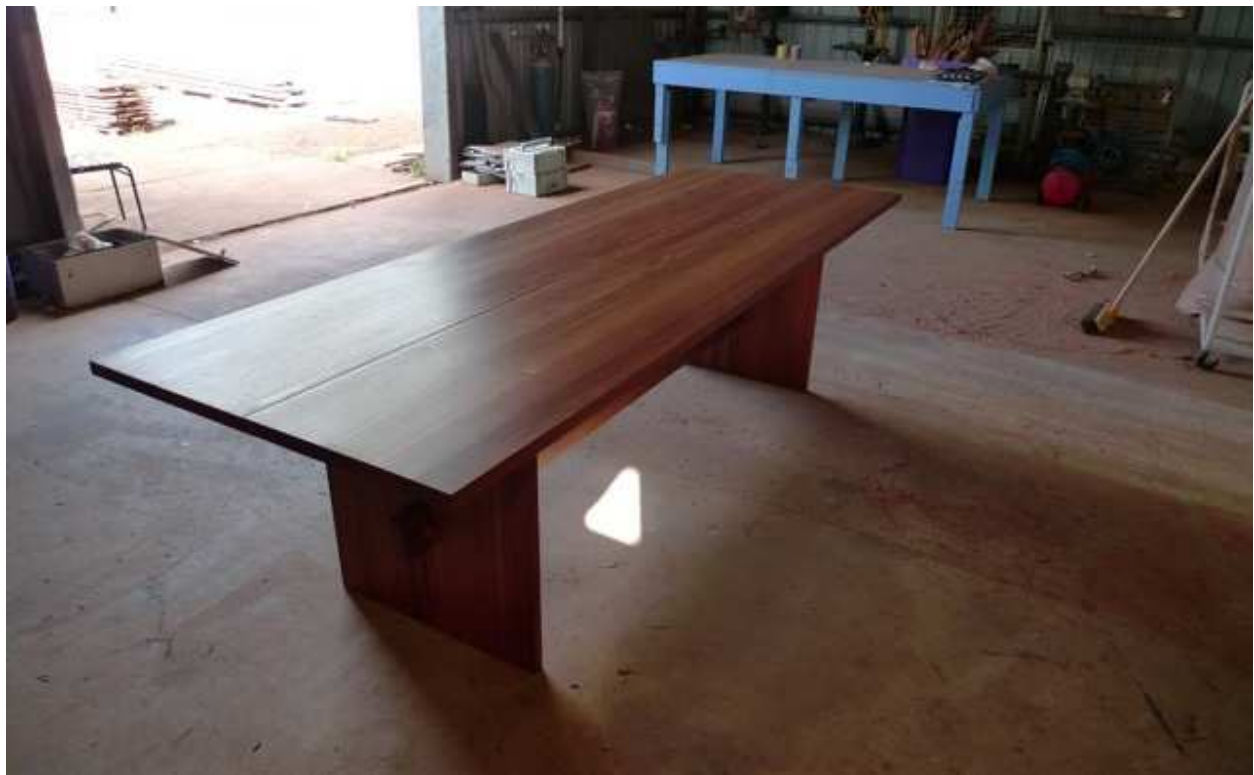
Fig. 10. The Boardroom Table

The number, different sizes, and geographical dispersion of Indigenous communities create enormous difficulties in supplying suitable furniture. Large distances between outland centres, and limited access to retail outlets compound transportation costs, while low incomes of Indigenous people limit purchasing power and the selection range. Furthermore, plastic, chip board, or plywood furniture lacks durability in overcrowded houses where there is a greater usage and wear and tear than is normal in non Indigenous homes. A novel technique to convince Yolngu members, who had never before made contemporary European furniture, was to begin at the high quality end of the spectrum. With guidance from a non Indigenous cabinet maker five large board room tables were made (Pearson & Helms, 2011). Valued at $3.5K each (3 metres long and 1 metre wide) they were sold locally. Figure 10 shows one of the tables. Currently, in a shed at Gunyangara, which contains a few industrial wood working machines, some Gumatj men are designing and making household furniture from eucalyptus tetrodonta. Outside the shed, under cover, are several tonnes of different sized milled timber being air dried. One important project is to make 50 single beds, and then to engage the Health Department personnel to teach the Indigenous ladies how to regularly sterilise the beds and mattresses. The overall goal is to prevent further outbreaks of scabies in the community.