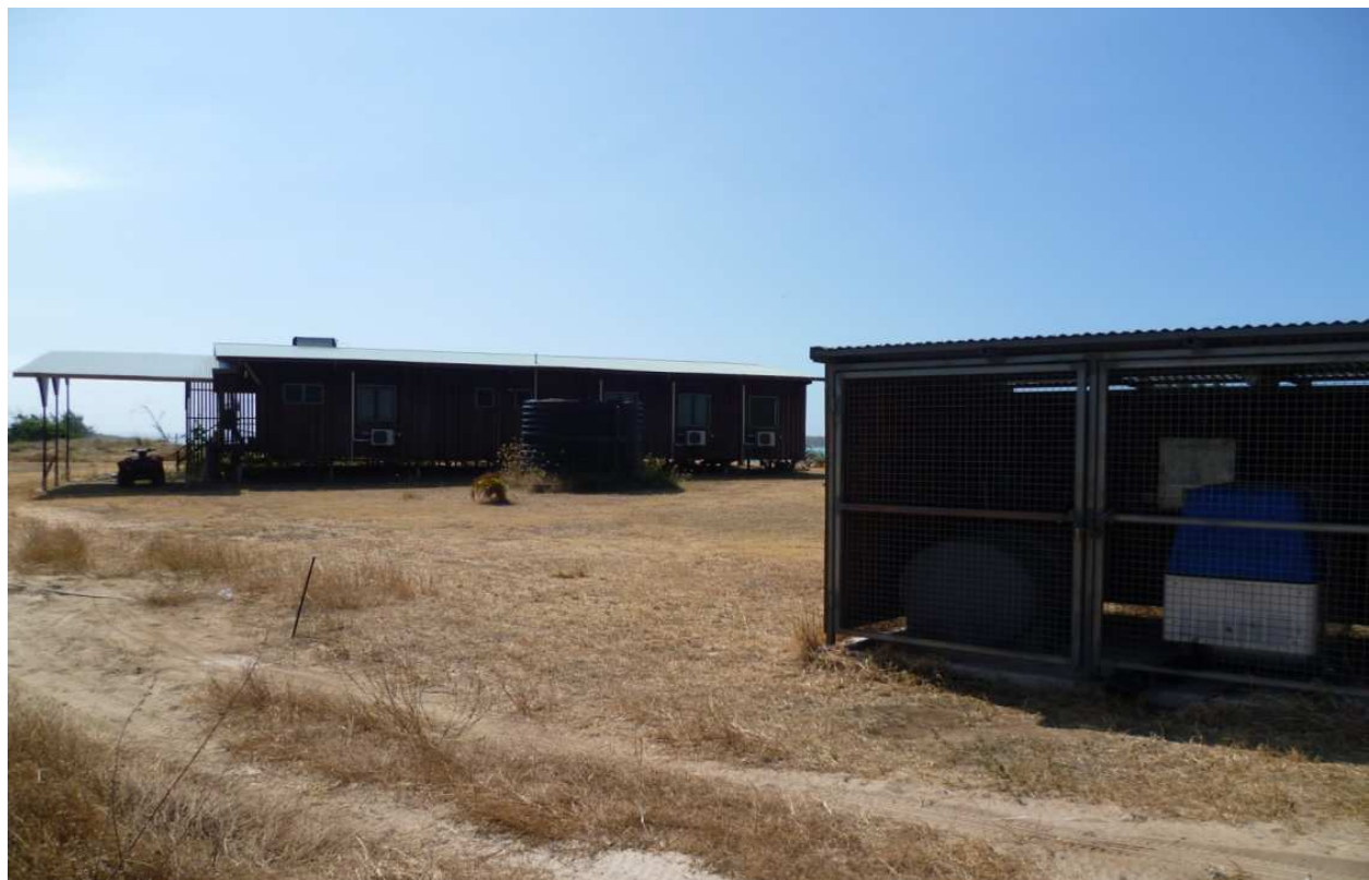
Fig. 7. The Generator Housing in the Foreground and the Dhanaya House