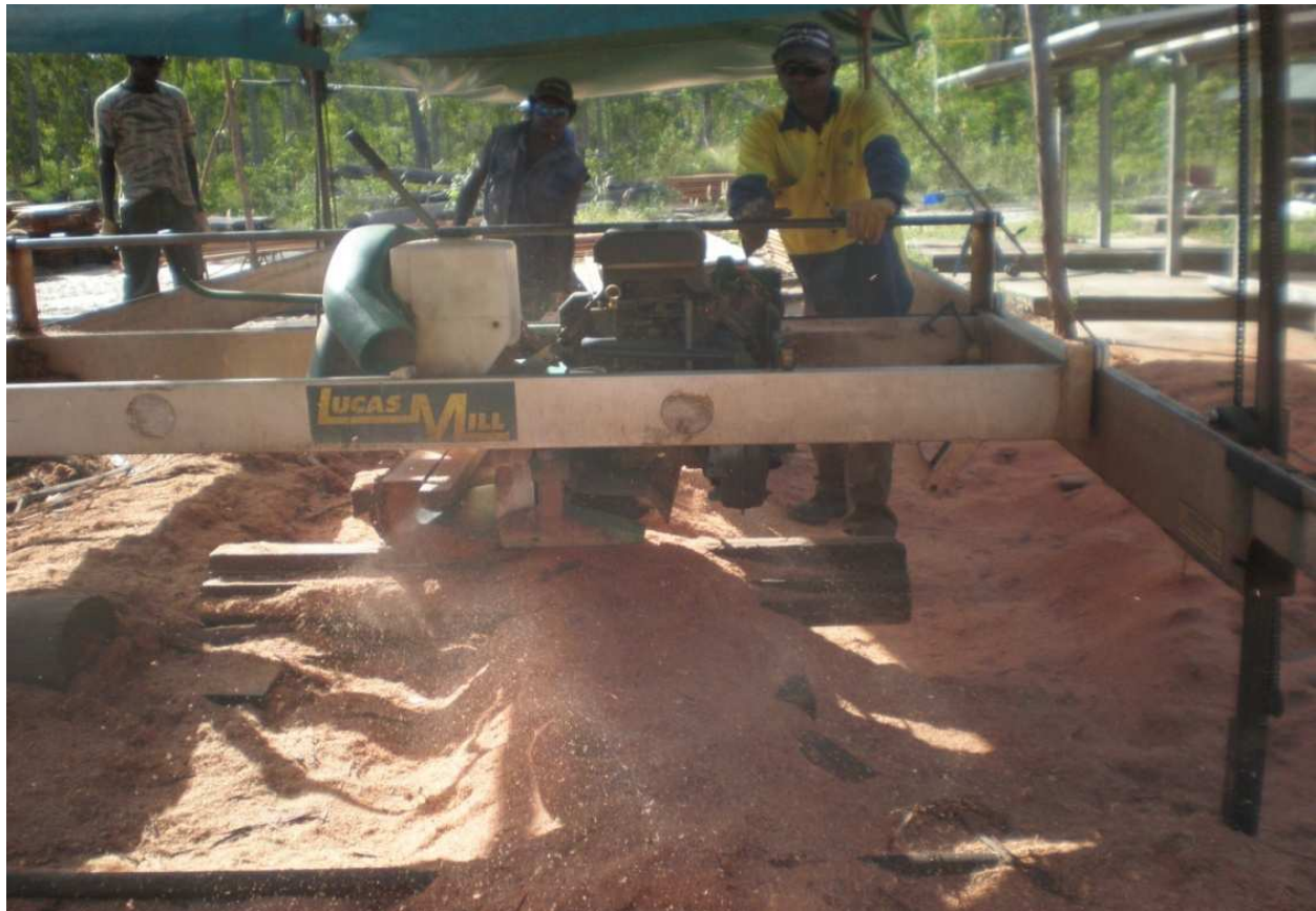
Fig. 2. A Team of Yolngu Men Operating a Lucas Mill

community development employment project scheme, and thus, are likely to be wedded to welfare. Poor employment prospects are consistently linked with the lowest income, the least educated and most unhealthy living conditions. In turn these patterns are associated with a multitude of social indicators such as material poverty, unhygienic housing, inadequate nutrition and unhealthy lifestyles, substance abuse (alcohol, tobacco, recreational drugs, petrol sniffing), higher incarceration rates, lower life expectancy, and epidemic rates of lifestyle diseases (diabetes, cardiovascular, coronary heart). Many of these fundamental differences with the non Indigenous population are experienced by Yolngu people as lesser life opportunities and weaker wellbeing.