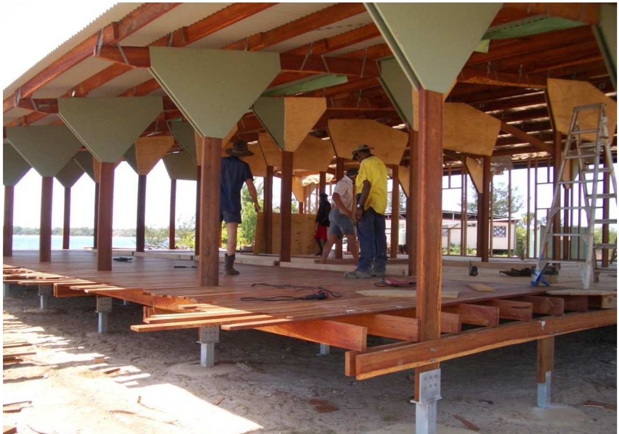
Fig. 6. The Dhanaya House during Construction

When occupied these original houses drew energy from a diesel powered generator. The new house, which had a floor plan of 18.9 metres x 12.5 metres, and an external garage, was predominantly built with hard wood timber that had been selectively harvested by a team of Gumatj clan men, from their traditional land about 10 km west of Dhanaya (Pearson & Helms, 2010b). Figure 6 shows the house during construction.