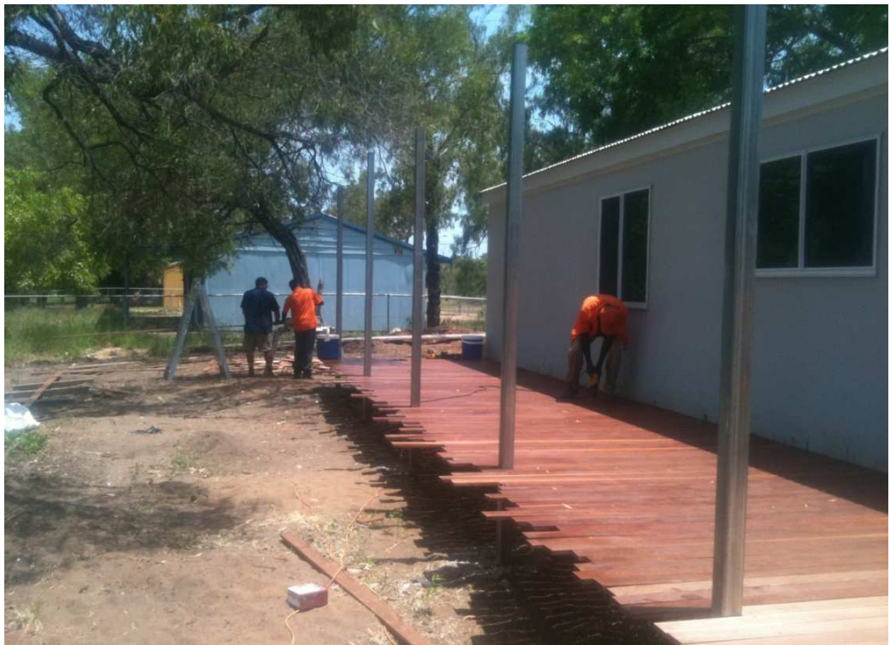
Fig. 9. Gumatj Men Constructing a Verandah on a Kit Home at Gunyangara

It is widely acknowledged that Aboriginal housing in Australia is deplorable. Inadequate maintenance and overcrowding of Aboriginal houses, especially in remote communities, demonstrates the prolonged failure of successive Australian governments to improve the unhygienic living conditions of Aborigines. To break this impasse the vision of Galarwuy Yunupingu was that the Gumatj men would build houses for their clan. But the reality was the time for building the Dhanaya house was about nine months, and many houses were required. Hence, an alternative practical strategy was to buy seven kit homes and have the Indigenous men assist the contractors by adding timber verandahs. Four of the houses were built at Gunyangara, and three others were erected in Nhulunbuy. Two of the three town houses are being rented and the third was sold to give the project a cost neutral outcome. However, the homes, which were designed in Tasmania for southern climates, have not been entirely satisfactory for the extreme weather conditions in East Arnhem Land. For instance, door and window frames shrink and expand in the 'dry' and 'wet' seasons, and window/door openings do not allow sufficient airflow, while the ceilings are too low for cooling fans. Consequently, the contractors have been invited to address a list of 'defects' and tender a revised design. Shown in Figure 9 are Gumatj men building an outdoor verandah from timber milled by their colleagues.