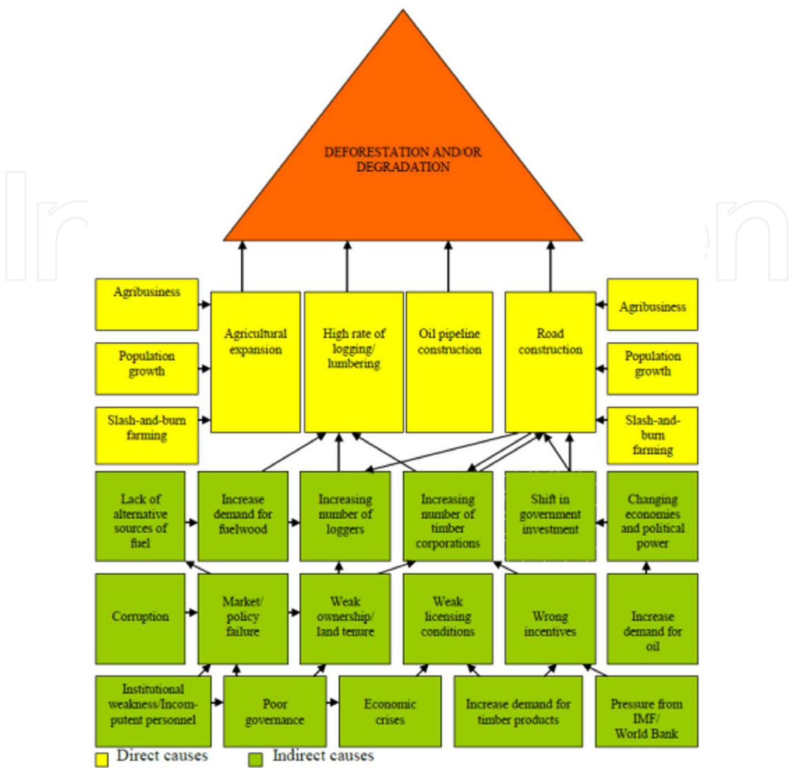
Fig. 1. Influence Diagram of Direct and Indirect Causes of Deforestation/Forest Degradation in Cameroon and the DRC