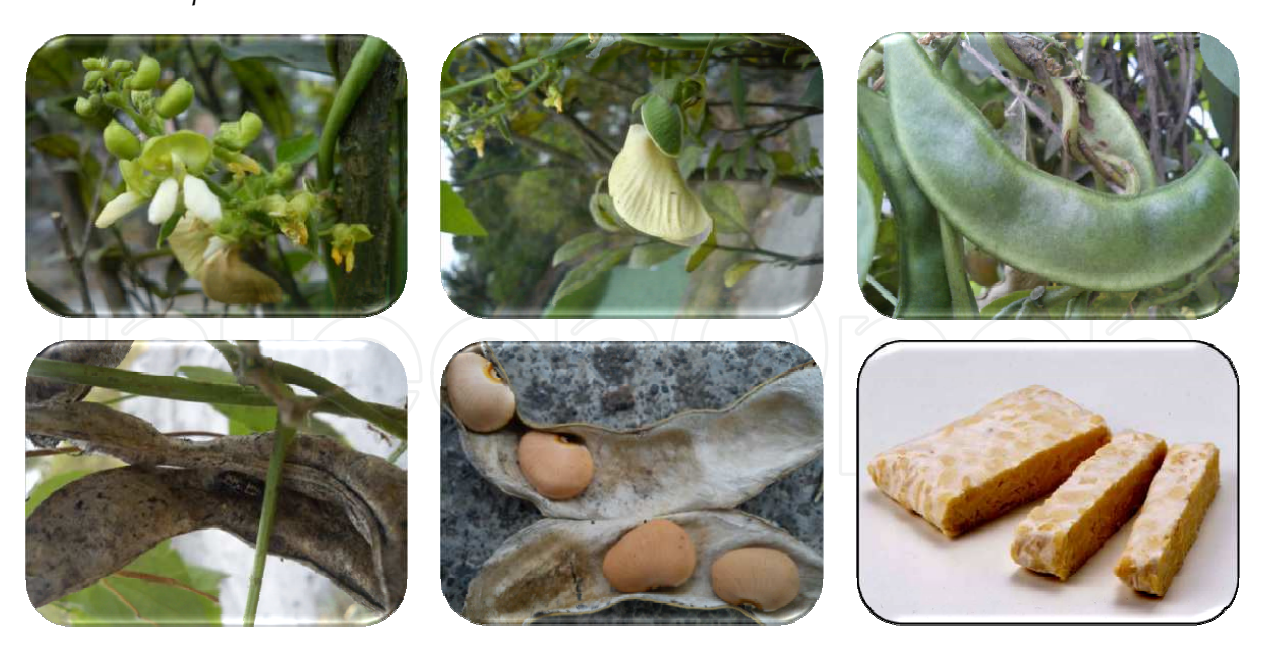
Fig. 1. Common climbing beans from young pod to matured seeds which can be used as vegetable, old seeds may be processed into tempeh mixed or supplemented with soybean.

Tempeh : This is a soy product that originated form Indonesia. It is made from whole soybean seeds which are soaked, dehulled and partly cooked. Spores of Rhizopus oligoporus , used a s fermenting culture is mixed with the seeds. The seeds are spread thinly on a tray and allowed to ferment for 24 to 36 hours at 30° C. Good tempeh is characterized by proper knitting together to have a firm texture. This can be cut, soaked in brine or salty sauce and then fried. Tempeh has also been processed from other types of beans or mixture with whole grains. Figure 1 shows the pod of climbing beans, the mature seeds and the processed beans made into tempeh .