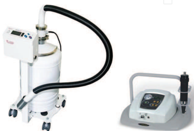
Fig. 1. Examples of stationary and portable cryotherapy apparatus

In some cases, excessive hyperaemia may worsen pain in the long-term (with a strong inflammatory component). In this case cold therapy instead of cryotherapy is recommended.