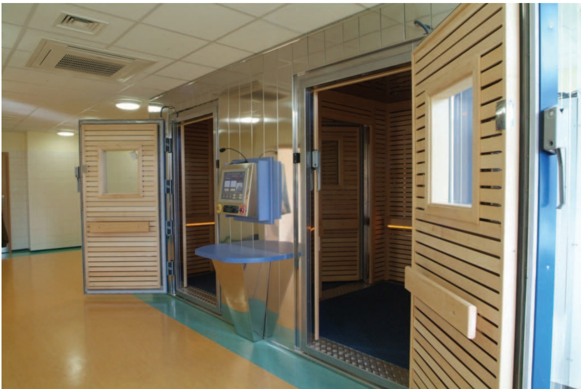
Fig. 3. Two stage cryochamber (CREATOR Sp. z o.o., Poland)