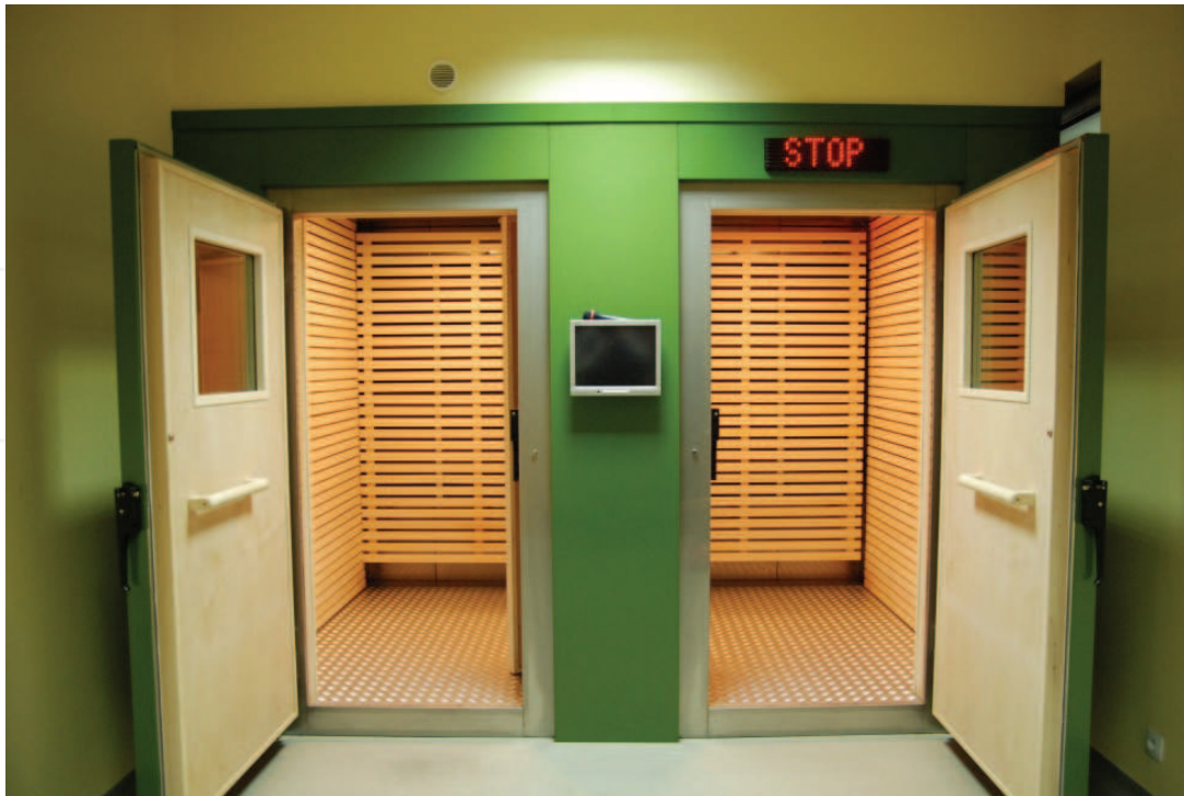
Fig. 4. Two stage cryochamber (KRIOSYSTEM Sp. z o.o. Poland)