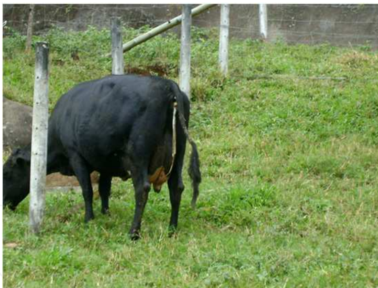
Fig. 1. Cow placenta exposed in the pasture. Situations as shown in this figure are common, characterized as a risk factor for infection by Brucella abortus in farmers who deal daily with livestock.

The fact that brucellosis be spread herds in several regions has caused concern from the standpoint of public health, especially when it comes to developing countries. The issue is more sensitive in rural areas, where habits of people in eating unpasteurized milk, as well as frequent contact with animal secretions and remains of the placenta (Figure 1) and aborted fetuses are, without doubt, most important risk factors to health human (Almuneef et al., 2004; Makita et al., 2010; Vasconcellos, 3003; Viana et al., 2009). Moreover, risk practices in rural areas such as skinning of stillborn lambs and kids, as well as crushing the umbilical cord of newborn lambs and kids with teeth can also be contributing factors (Hussein et al., 2005). However, situations such as the habit of eating aborted fetuses by populations in Equedor, can be characterized as a risk factors (Mantur & Amarnath, 2008).