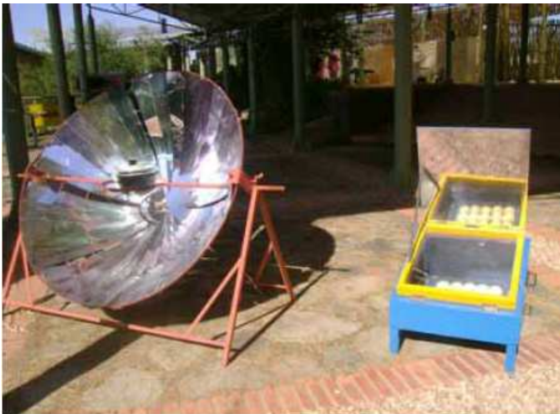
Fig. 1. Solar cookers (parabolic and box cooker)