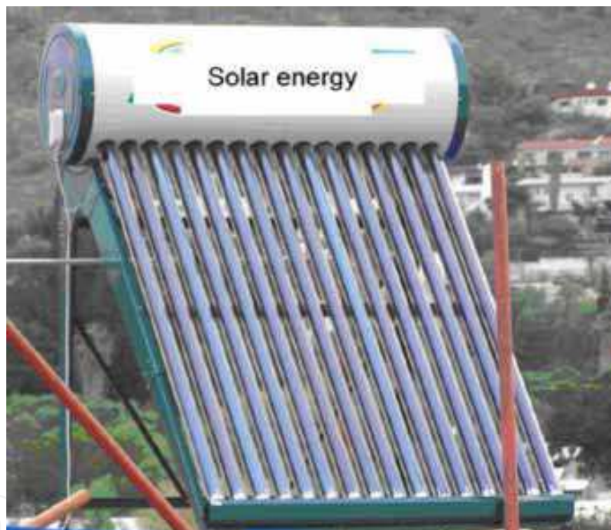
Fig. 3. Direct Heat Exchange via Vacuum Pipes.