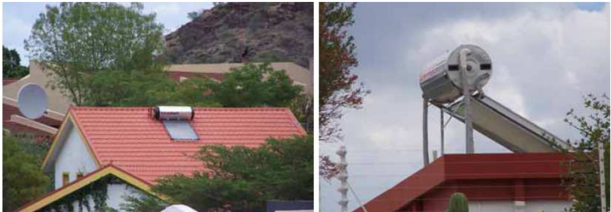
Fig. 2. Indirect Solar Water Heater Systems with heat collector. Source: Wienecke and Mawisa ,(2008).p.15.