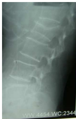
Fig. 1. Lateral X-ray at admission.

In this group of patients, the volume of bone cement injected in each vertebral was 3 ~ 6.5ml. When intraosseous vertebral venography were performed before the injection of bone cement, paravertebral vascular developed an image in 5 cases, then filled the gelatin sponge; peripheral cement leakage was found in 4 cases, intervertebral disc leakage was found in 2 cases and posterior margin leakage was seen in 2 cases (posterior longitudinal ligament is not exceeded), no clinical symptoms appeared. No nerve root or spinal cord injury,no pulmonary embolism or other complications were recorded. All patients had no further vertebral fractures. At admission,preoperative and postoperative X-ray films were shown in Figure 1-7. Figure 2 showed that bolster for self-replacement restored vertebral body height, corrected the kyphosis angle. Figure 5-7 showed that the PVP surgery could maintain and enhance the effect.The stata was showed in Table 1. Bolster for self-replacement combined with percutaneous vertebroplasty significantly improved VAS scores, analgesic use score and activity score, The results were shown in Table 2.