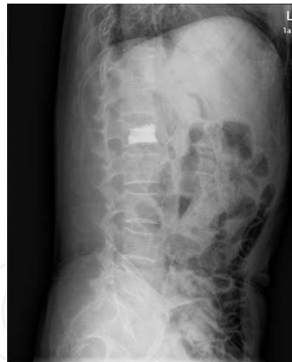
Fig. 9. Lateral X-ray after PKP.