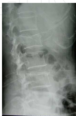
Fig. 2. Lateral X-ray before operation.