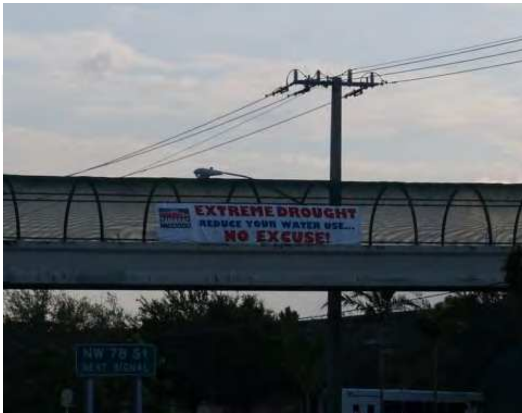
Fig. 4. This is an example of a short term conservation strategy as reflected by the sign over the road in Tamarac, Florida reading "Extreme drought, reduce your water use, no excuse."

demands or when the cost of delivering water becomes prohibited (Kjelgren et al., 2000). There are several tools available for conserving water in the urban landscape such as low-water use landscapes, precision irrigation, and alternative water sources.