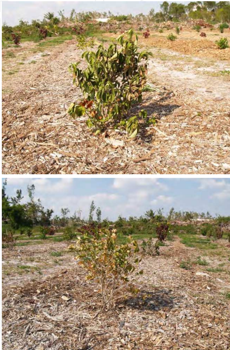
Fig. 1. Viburnum ( Viburnum odorotissimum ) and orange jasmine ( Murraya paniculata ) plants showing signs of water stress (yellowing/browning leaves, wilting, and leaf drop). Plants were grown in field plots at the University of Florida, Fort Lauderdale Research and Education Center, Davie, FL

The challenge is to adequately irrigate urban landscapes and conserve water. When plants become stressed due to a lack of water, growth and development are decreased. Symptoms of water stress include wilting, yellowing or browning of leaves, leaf drop (abscission), decreased leaf size, decreased leaf number, and reduced photosynthesis (Fig 1) (Taiz and Zeiger, 2006).