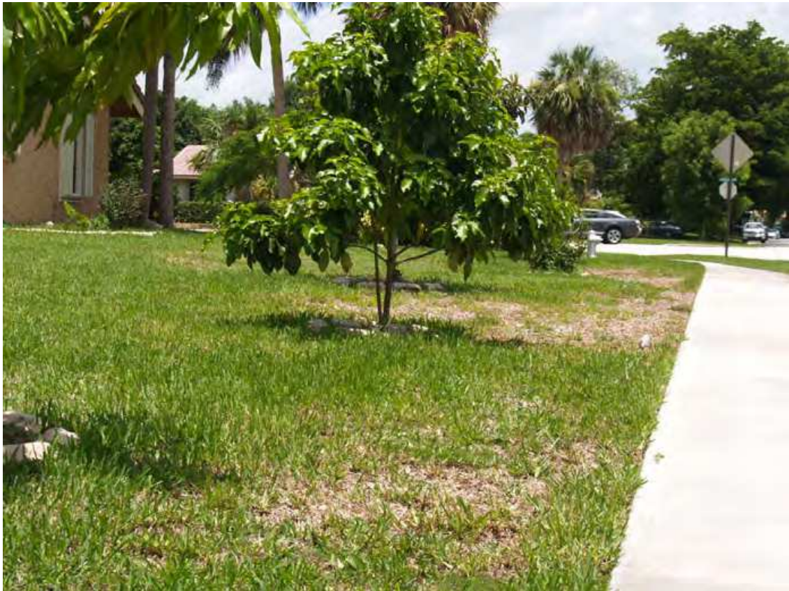
Fig. 3. This picture is an example of symptoms related to non-uniform irrigation of turf resulting in dry patches as well as green patches.

of water applied in most urban landscapes is usually above baseline needs due to non-uniformity of application (Fig 3). For example, the application of more water to dry spots will result in over-irrigation in other parts of the landscape. The goal is to reduce the difference between minimum and maximum wetted areas (Zoldoske et al. 1994).