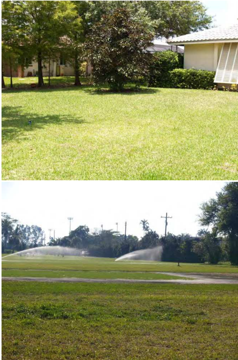
Fig. 2. Two pictures showing examples of common urban landscapes in south Florida. The first is a residential home with a mixture of turfgrass, trees, shrubs and other ornamentals while the second is an athletic field composed mainly of turfgrass.

agronomic crops that are valued based on yield, ornamental landscapes are a mixture of plant materials that are valued for their appearance. According to Kjelgren et al (2000) the amount of water applied to the landscape can be divided into three levels of usage: 1) water needed to meet baseline physiological needs, 2) water needed to compensate for irrigation system non-uniformity to ensure all plants receive baseline levels, and 3) water applied in excess of plant needs that could be conserved.