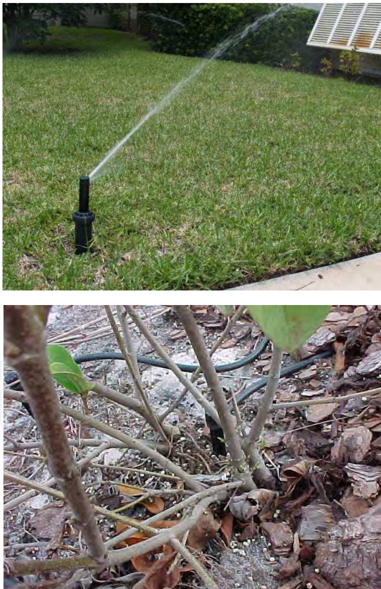
Fig. 5. Comparison of typical home irrigation versus the use of micro-irrigation at the base of the shrub or tree

One of the biggest barriers to installing water-efficient landscapes is public perception about appearance or aesthetics (Hurd et al., 2006). According to a survey by Lockett et al. (2002), only 9% of respondents in Lubbock, TX felt water-conserving landscapes were aesthetically pleasing while 61% felt the opposite. Unfortunately, most individuals imagine water efficient landscapes as gravel landscapes interspersed with some drought tolerant plants (St Hilaire et al, 2008).