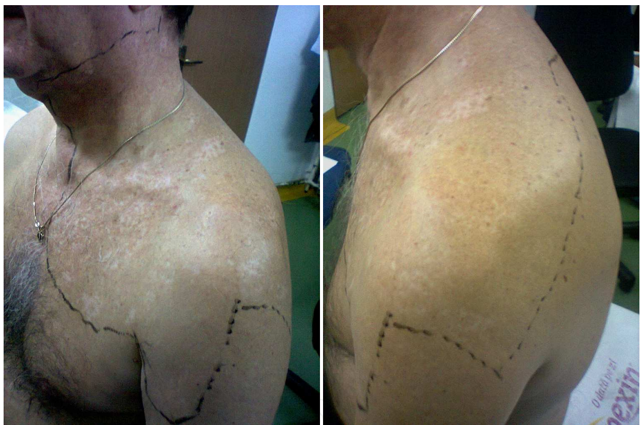
Fig. 1. a)

suggests central sensitization process on spinal level by pre- and post-synaptic changes on second-order neuron induced by ongoing C input: temporal summation, mechanical dynamic and static allodynia. Analyzing the patient's pain in this manner, it is easier to choose the potential optimal pharmacological agents. For this patient a selective sodium channel blocker, like carbamazepine or tricyclic antidepressive and \mu -receptors agonists, opioids, are not suitable because of myasthenia gravis. A calcium-channel blocker \alpha_2 - \delta ligand was recommended with a rating of 8 (VAS) for the mean pain intensity per month. Further local application of capsaicin patch (8%) lowered the pain up to a rating of 5, which the patient considered acceptable in the long run.