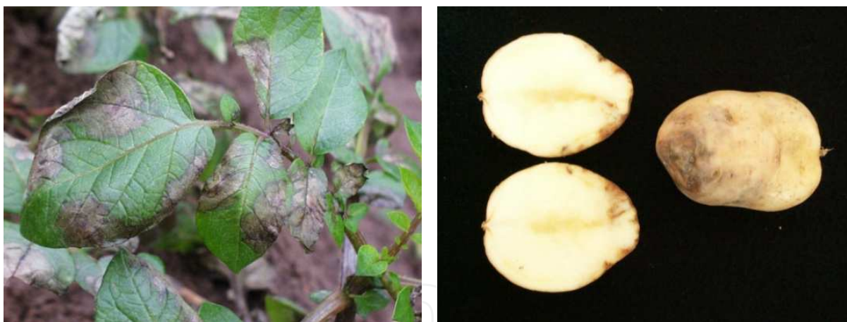
Fig. 1. The symptoms of late blight ( Phytophthora infestans ) infection in potato leaves and tubers.

Prior to the arrival of Phytophthora infestans only two other potato diseases were known in Ireland (Bourke, 1964). The disease was first observed in September 1845 on Lumper potatoes. It spread quickly and destroyed a vast proportion of the yield in that same year. In subsequent years until 1850 the disease recurred each season, destroying yields to such an extent that people did not have sufficient seed potatoes to plant, far less to eat (Fraser, 2003). Between 1845 and 1850 approximately 2 million people lost their lives (Cousens, 1960) and 1–1.5million emigrated (Boyle & Gráda, 1986). Later in the 19 th century the disease spread throughout the whole of Europe. Current studies suggest a three-step introduction process for the pathogen, including a first migration from central Mexico to South America several