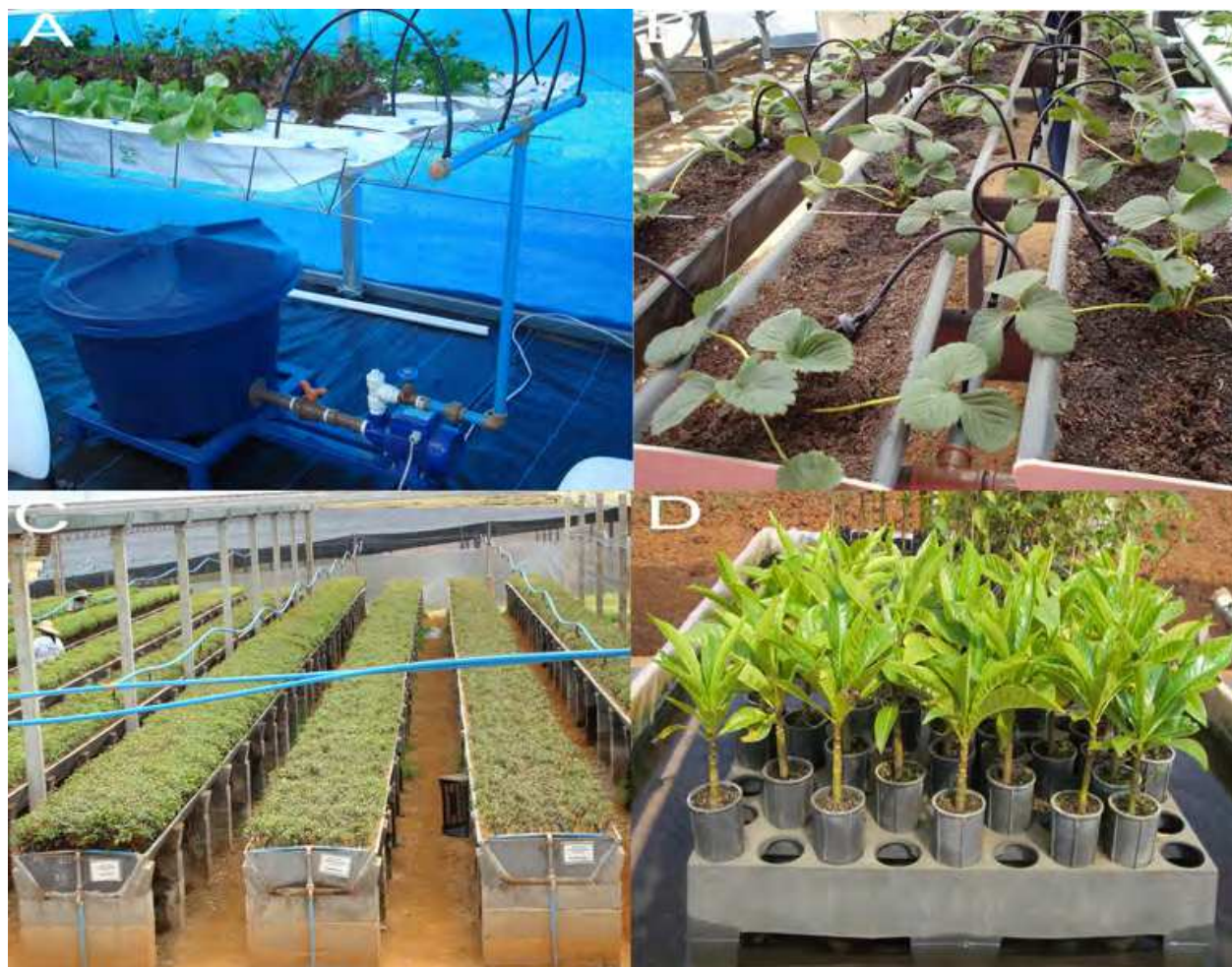
Fig. 1. Main types of hydroponics: A) NFT: one of the most used for growing hardwoods. This prototype uses fixed hardware and cultivation channels are double-sided facilitating the disinfection of the system; B) and C) Substrate: a system that allows the use of substrate with the nutrient solution percolation. It is also suitable for the production of fruit tree seedlings, D) DFT or Floating: a model suitable for production of seedlings of fruit trees. This example refers to the production of seedlings “Jenipapo” ( Genipa americana L.) by using seeds.

Cultivation can be conducted in pots, mineral wool or plastic bags. Formerly these systems were open, however, the loss of water and nutrients, and the risk of environmental contamination with effluents led to the adoption of the circulating system. When passing through the substrate that composes the cultivation area, the nutrient solution composition has changed, beyond the incorporation of suspended solids; therefore the lixiviated should be filtered, disinfected and returned to a closed system (Prieto Martinez, 2006).