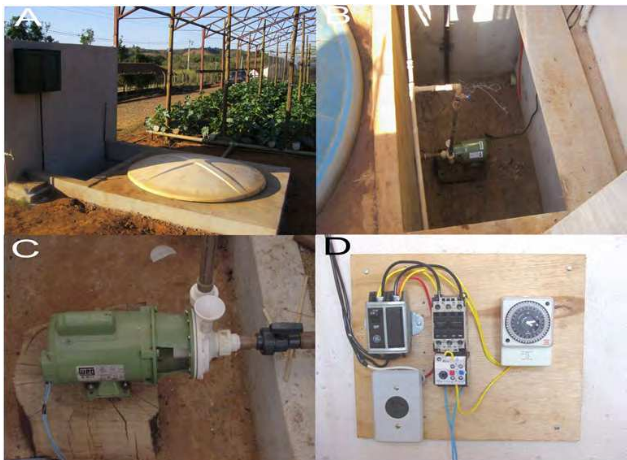
Fig. 2. Detail of the pump house (under construction) illustrating: A) Hydroponics being built by focusing the detail of water tank buried in the soil to avoid heating, B) and C) Set motor pump installed in a primed (below the level of reservoir), D) Panel containing outlet, timer relay and nutritious species.

The place where will be accommodate the motor-pump set must be as fresh as possible to avoid heating the solution. In general the reservoir can be buried in the soil to or build masonry to keep the tank and electrical system that support the pump and timer. In tropical locations the temperature in solution can be very high reaching 104° F, which enables the cultivation. In this sense, especially in warm regions the accommodation of the nutrient solution reservoir should be correctly kept (Figure 2 A).