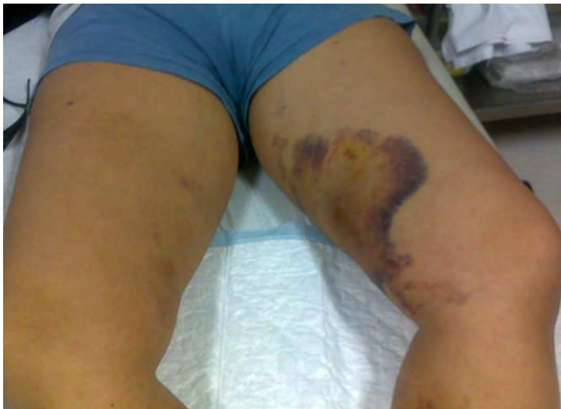
Fig. 4. Ecchymosis on the left lower limb after a bilateral EVLA procedure

Skin burns following EVLA have been reported but are relatively rare and seem avoidable with adequate tumescent anesthesia.