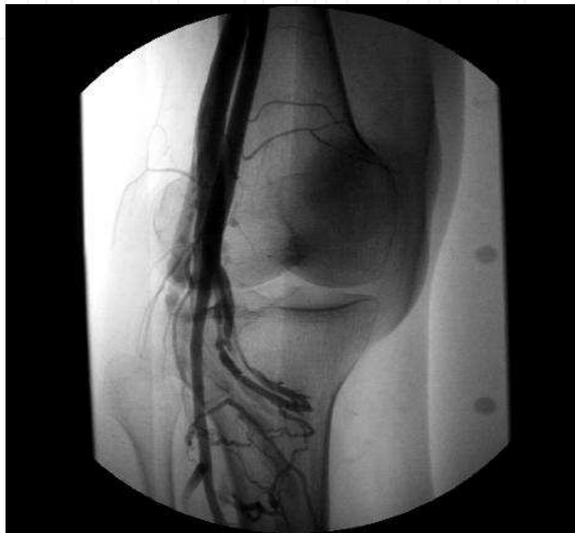
Fig. 5. Popliteal stage arteriography depicting an AV fistula between branches of the popliteal artery and a genicular vein after an EVLA procedure.

There are some case reports in the literature of an arteriovenous fistula between a small popliteal artery branch and the SSV (Vaz et al 2008). Although thought to be related to a heat induced injury caused by thermal energy from the laser device, an arteriovenous fistula could be caused by a needle injury during tumescent anaesthetic administration. To minimize the risk of these arteriovenous fistulas is necessary a careful advancement of the intravascular devices, atraumatic delivery of the tumescent fluid, the use of adequate amounts of tumescent fluid and the subfascial portion of the SSV where the popliteal artery branches exist, should be avoided. (figure 5).