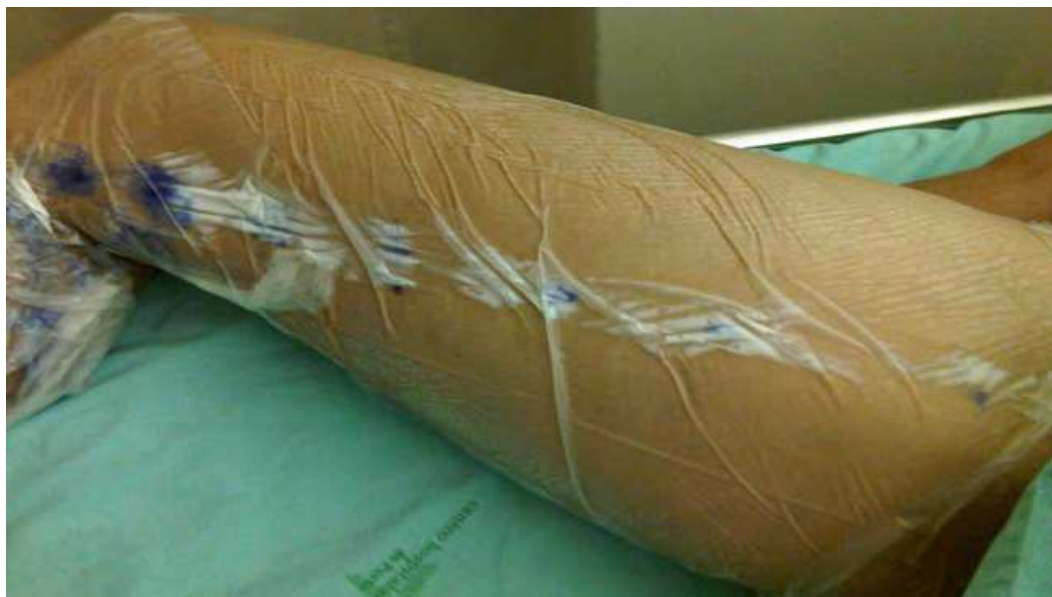
Fig. 1. Pre-operative marking of the vein, topic anesthetic on the length of the vein being treated

Duplex ultrasound has become the reference standard in assessing the morphology and hemodynamics of the lower limb veins. Preoperative duplex planning for EVLA is extremely important in order to avoid potential complications. Almost all modern ultrasound scanners used for imaging peripheral venous disease should be suitable for preoperative imaging and for guiding endovenous procedures. Typically linear array transducers with a frequency in the range of 5-12 MHz are suitable. During this examination it is important to evaluate the anatomy and the physiology of both the superficial and deep venous systems. EVLA is a good treatment option for eliminating reflux in a straight superficial venous segment. Indications for ablation include reflux in a truncal vein of a duration greater than 0,5 seconds, that is responsible for patient symptoms or skin changes. Measurement of the vein diameter should be carried out during the course of pre-operative ultrasound for the calculation of the appropriate energy density. The duplex ultrasound inclusion criteria for this treatment are: veins with a 2mm or more diameter but preferably with 3mm or more and a treatable length of at least 10-12 cm. The course of the saphenous vein, from the saphenofemoral or saphenopopliteal junction to the insertion site is mapped by ultrasound. An indelible marking pen is used to mark incompetent sources of venous reflux under duplex ultrasound guidance before the procedure (figure 1).