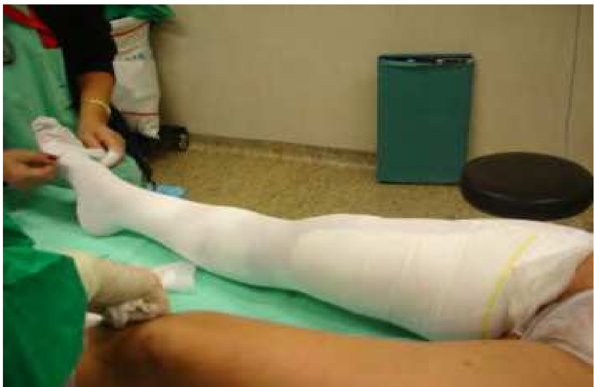
Fig. 3. Graduated compression stockings placed at the end of the procedure