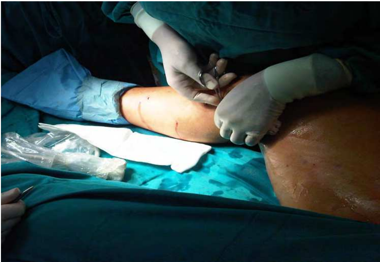
Fig. 2. Ancillary ambulatory phlebectomy performed immediately after the EVLA procedure