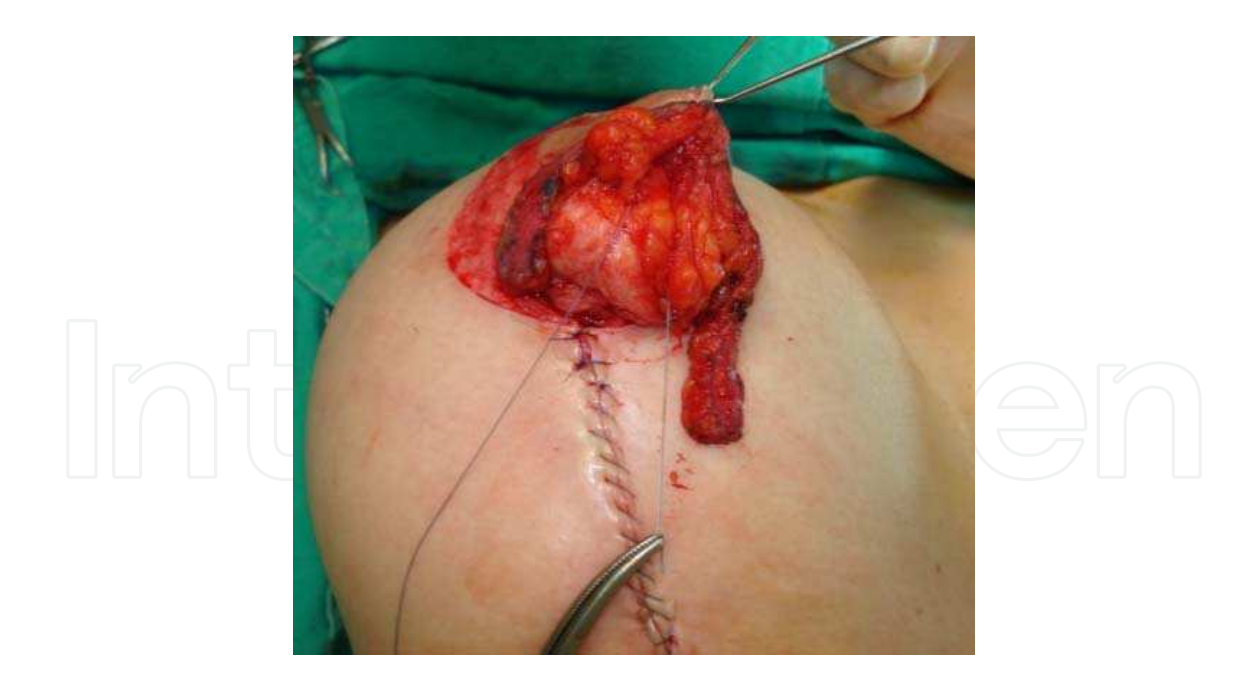
Fig. 6. A satisfactory projection of the nipple was seen at the end of the procedure.