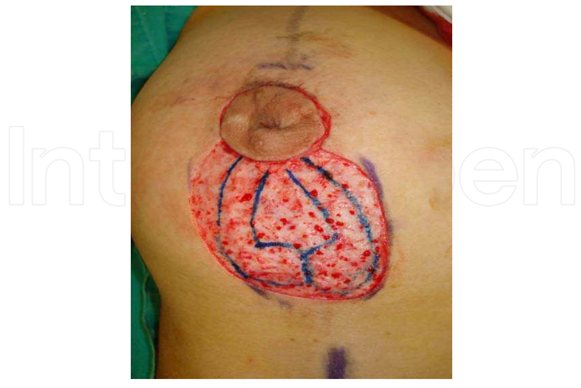
Fig. 4. The marked area below the areola was de-epithelialized. Antenna flaps were marked on this area.

Flaps were elevated to include dermis and 5 mm of fat tissue beneath and attached to the dermal flap using an electrocautery (Fig. 5).