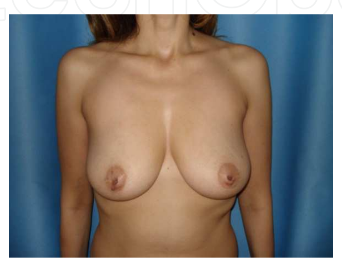
Fig. 2. A woman with a history of congenital inverted nipple is seen. AP view.

Preoperative Marking :Preoperative planning started with the patient standing. The preliminary marking was identical to that for circumvertical mastopexy. The midline, breast meridian with its extrapolation on the chest wall, and the inframammary fold were marked. The lateral and medial markings were made while pushing the breast laterally and medially with an slight upward rotation, in accordance with the vertical axis drawn below the breast. The new areola was then marked in a classical dome shape. Finally, the lower marking was made. This joined the medial and lateral markings at a level 2 cm above the preexisting fold. The marked area below the areola was used to mark the antenna flap. Marking was done to optimally use the existing de-epithelialization area (Fig. 2, 3).