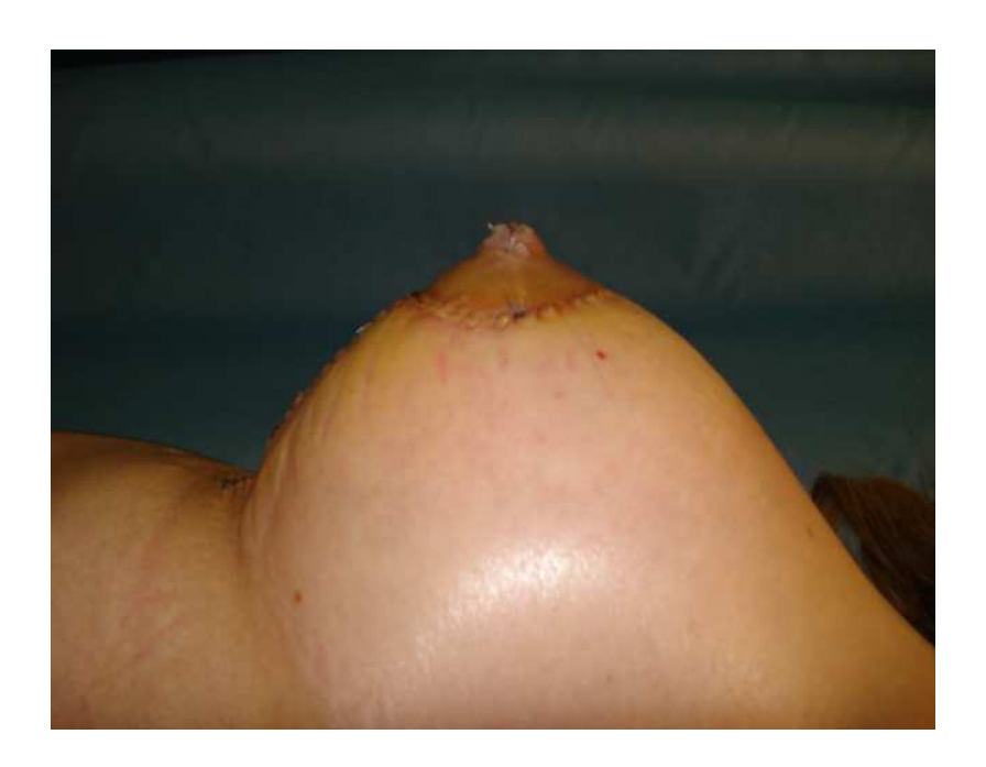
Fig. 7. Early postoperastive result is seen.

It has been reported that the patients tolerated the procedure well. No major vital complications like major flap or nipple necrosis has been reported with this technique. In this technique, a high rate of success has been reported that no recurrence of nipple inversion after one and a half-year reported. As of patient satisfaction the technique seems promising that the shape and projection of the patient's nipple was deemed satisfactory (Fig. 8, 9).