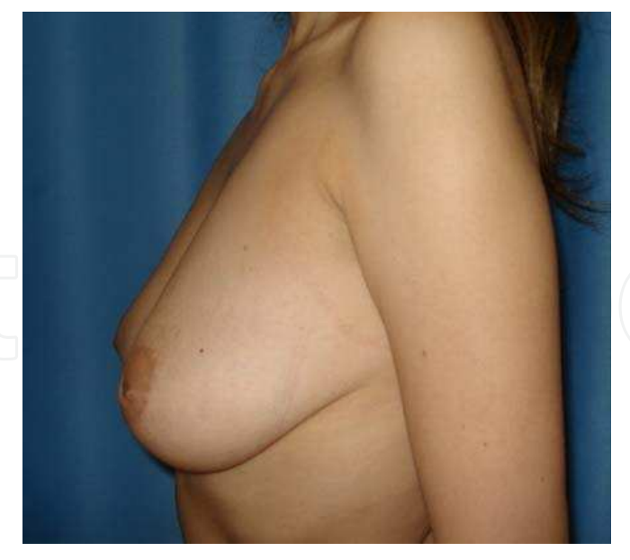
Fig. 3. Lateral view of the same woman in Fig 2.

Surgical Technique: The operative sequence for augmentation mammoplasty was more straightforward. The marked area below the areola was de-epithelialized. Antenna flaps were marked on this area (Fig. 4).