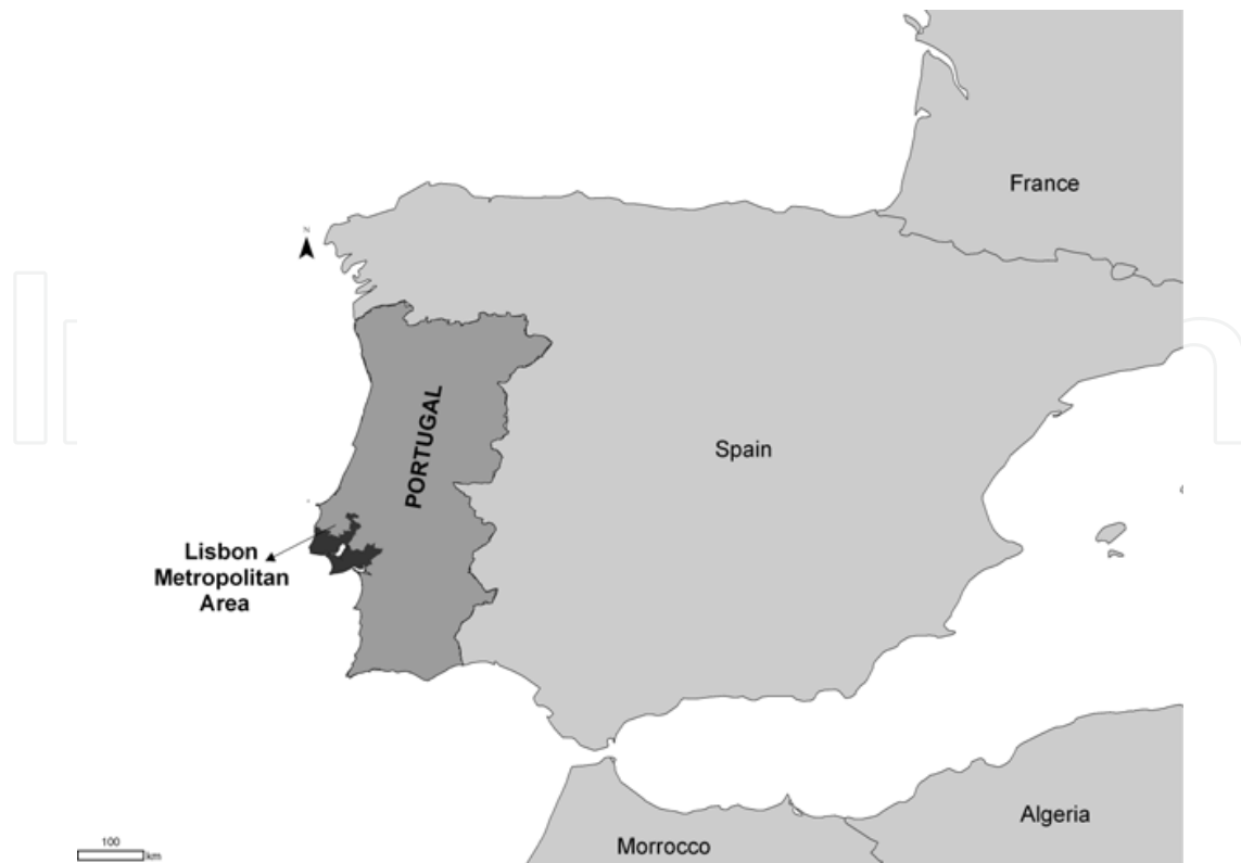
Fig. 1. Lisbon Metropolitan Area, Portugal