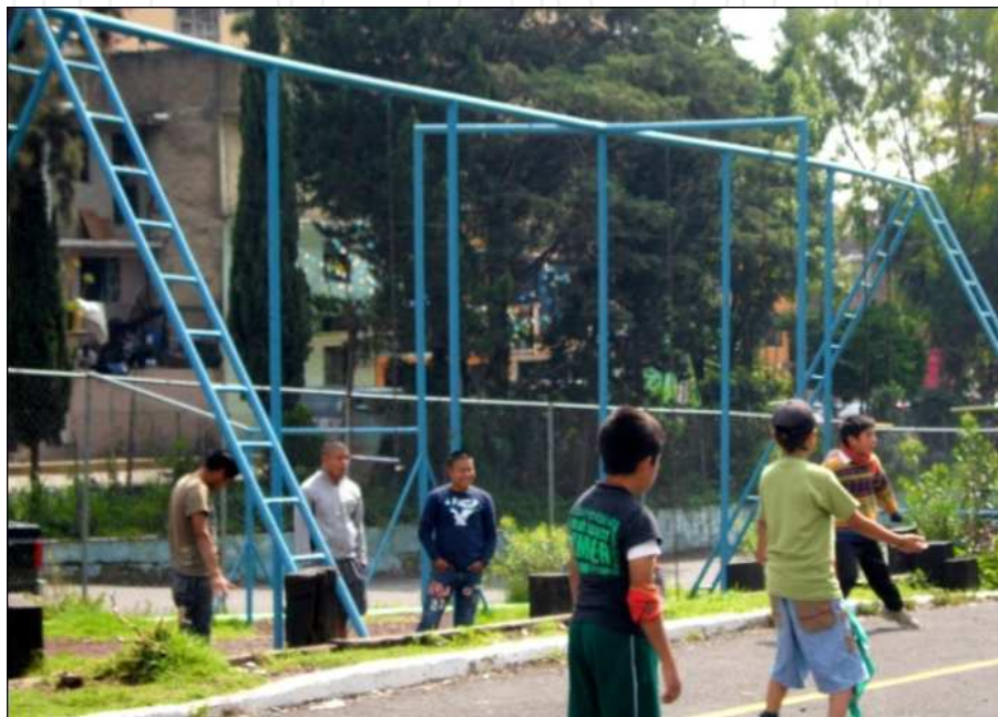
Fig. 10. Onlooking community members smoking marijuana.

It is important to mention some of the barriers that presented themselves for the correct development of the workshop. Some members of the community did not respect the space in which the activities were developed and they met every day from 10 a.m. to smoke marijuana next to the soccer field, little by little impinging upon the space for the development of the programmed activities (Figure 10). This is a real example of what occurs in the few spaces designed for the practice of physical activity.