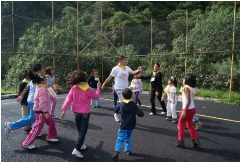
Fig. 6. Children’s games and rounds.

Additionally, we included activities with basic healthy-eating Concepts, including knowledge of the Healthy Eating Dish, the practical concepts of the complete and varied diet, as well as the importance of the consumption of fruits, vegetables, and water (Figures 7 and 8).