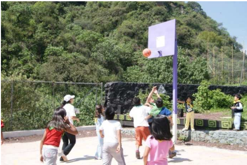
Fig. 5. Basketball.

The main strategy for complying with the objectives was the involvement of the children in a non-violent environment, in traditional games (children’s songs and rounds, hoops, jump rope) and in sports such as soccer, basketball, volleyball, races, and rallies, which took place on the site’s public sports courts and playing fields (Figures 5 and 6).