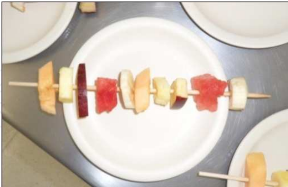
Fig. 1. Fruit kabob

these as part of the workshop’s activities, the children prepared some recipes such as fruit kabobs, vegetarian robots, and diverse figures such as a ship with vegetables; similarly, they prepared a certain recipe such as a fruit and veggie rainbow (Figures 1-3).