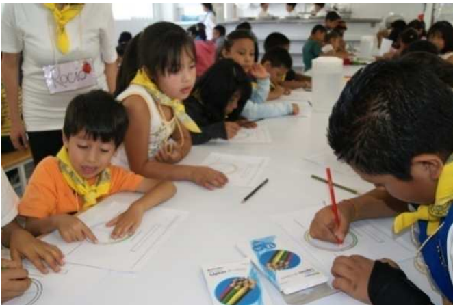
Fig. 7. Coloring “The Healthy Eating Dish”.

Additionally, we included activities with basic healthy-eating Concepts, including knowledge of the Healthy Eating Dish, the practical concepts of the complete and varied diet, as well as the importance of the consumption of fruits, vegetables, and water (Figures 7 and 8).