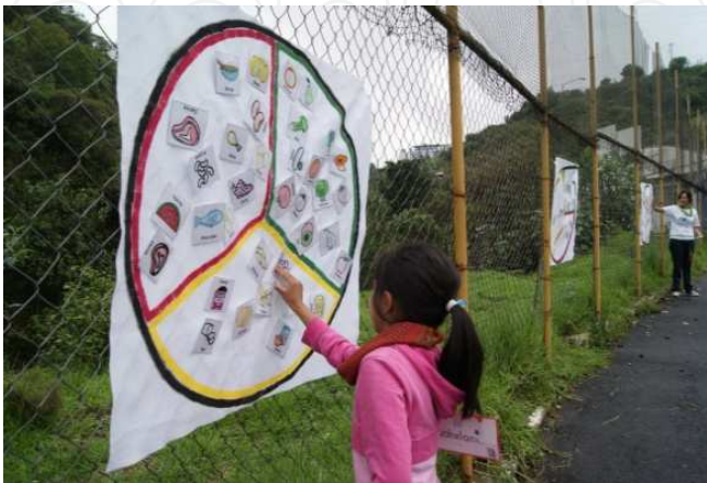
Fig. 8. Identifying foods on the “The Healthy Eating Dish”.