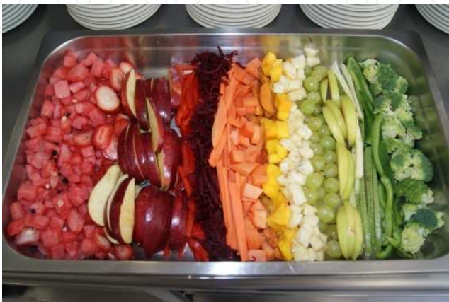
Fig. 3. Fruit and veggie rainbow