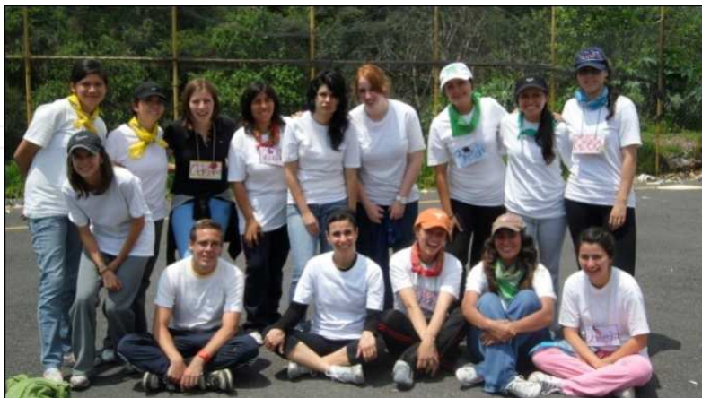
Fig. 4. Cheerleader Group 1.

The main strategy for complying with the objectives was the involvement of the children in a non-violent environment, in traditional games (children’s songs and rounds, hoops, jump rope) and in sports such as soccer, basketball, volleyball, races, and rallies, which took place on the site’s public sports courts and playing fields (Figures 5 and 6).