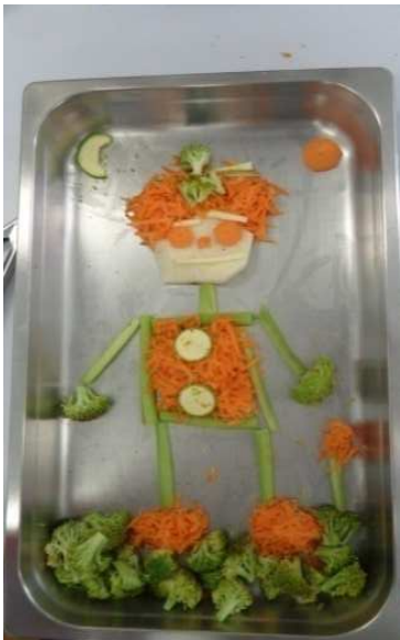
Fig. 2. Vegetarian robot