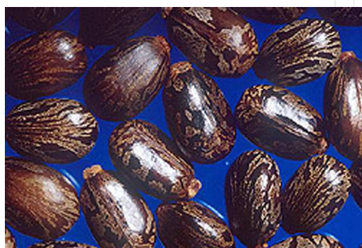
Fig. 2. Castor seeds

Castor seeds contain large amounts of ricin, which is also present in lower concentrations throughout the plant. Ricin content significantly varies among cultivars/accessions and may range from 0.1 to 4% of the weight of the seed (Auld et al., 2003; Baldoni et al., 2011; Pinkerton et al., 1999). Ricin is one of the most potent poisons in the plant kingdom (Lee & Wang, 2005). Because of the wide availability of its source plants, ease of production, stability, and lethal potency, ricin toxin is considered to be a bioterrorism threat. Ricin is the most common biological agent used in biocrimes, and has also been reported as one of the most prevalent agents involved in WMD (weapons of mass destructions) investigations (FBI, n.d.). Recent attempted uses of ricin by various extremists and radical groups have heightened concerns regarding ricin's potential for urban terrorism.