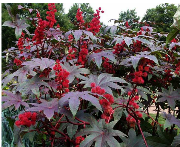
Fig. 1. Castor plant, Ricinus communis , a large shrub having large palmate leaves and spiny capsules containing seeds that are the source of castor oil and ricin (Adapted from http://dtirp.dtra.mil/images/RicinusCommunis.jpg )

Ricin is one of the most toxic and easily produced plant toxins. It is derived from the castor plant, Ricinus communis (Fig. 1), a shrub native to Africa but currently is being cultivated in many areas of the world for its commercial products, primarily castor oil. The seeds of R. communis , commonly called beans (although not a true bean) (Fig. 2), are oblong, brown, and have a thick mottled shell sometimes used to make decorative necklaces and bracelets. Castor seeds contain 40 to 60% vegetable oil that is rich in triglycerides, mainly ricinolein (McKeon et al., 1999). Castor oil is used in a number of products. For many years, purified castor oil has been ingested as a human nutritional supplement, emetic, or purgative worldwide (Scarpa and Guerri, 1982; Caupin, 1997; Olsnes, 2004). In addition to castor oil production, castor plants are also being grown for aesthetic (ornamental garden bush) and ecological values. It is used extensively as a decorative plant in parks and other public areas. Ecologically, despite the ricin being poisonous to humans and many animals, R. communis is the host plant of insects including moths and butterflies, and is also used as a food plant by some Lepidopteran larvae and birds.