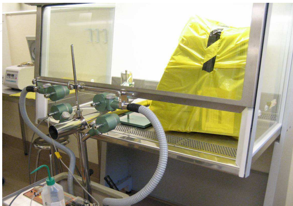
Fig. 2. The unique potassium iodide KI-disc-test, to validate a class II safety cabinet with a DNA isolation robot in a BSL-3 laboratory. The KI disc test is defined in the European Standard for microbiological safety cabinets, EN12469:2000 as a test method for validating the operator protection capabilities of the cabinet.

laboratories is based on traditional methods such as labor intensive cultivation, autopsy and necropsy. However, there is a need to have alternative methods for complementary tests such as molecular based instruments in a BSL-3 level or BSL-4 environment. It is therefore important to evaluate computers, DNA extraction robots and PCR equipment from an operational point of view for these laboratories.