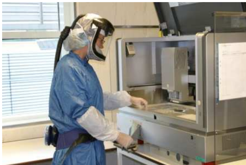
Fig. 3. Up-scaling capabilities by the use of automated DNA extractions robot in a BSL-3 laboratory.

High-resolution diagnostic tools. Multiplexing strategies for detection of several biomarkers (Lindberg et al., 2010), as well as various molecular typing methods are useful for crime scene investigation, but also for tracing and tracking the deliberate contamination. The use of massive parallel sequencing will be useful to study strain isolates from a suspicious deliberate contamination event. By applying bioinformatics it is possible to rapidly analyze large amounts of sequence data with minimal post-processing time (Segerman et al., 2011).