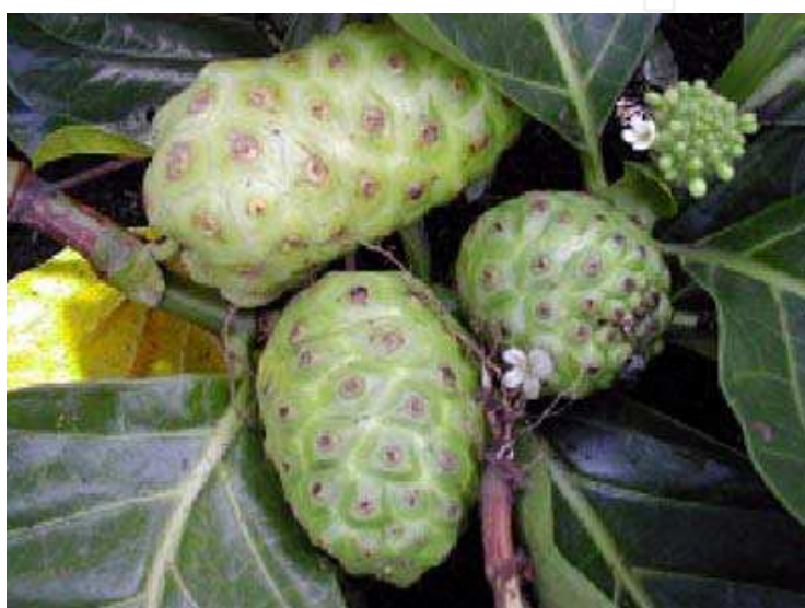
Fig. 1. Unripe fruit

The genus Morinda ( Rubiaceae ), which includes the species M. Citrifolia L., is made up of around 80 species. M. Citrifolia is a bush or small tree, 3-10 m tall, with abundant broad elliptical leaves (5-17 cm length, 10-40 cm width).