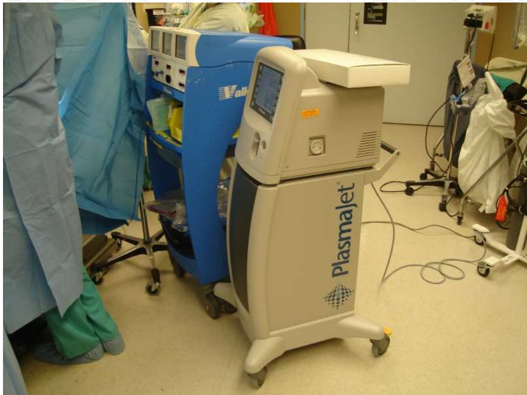
Fig. 3. Plasmajet®

Plasmajet® by Plasma Surgical Limited is the product of newer technology for hemostasis during surgery (figure 3). It works in a similar manner to the argon beam coagulator.