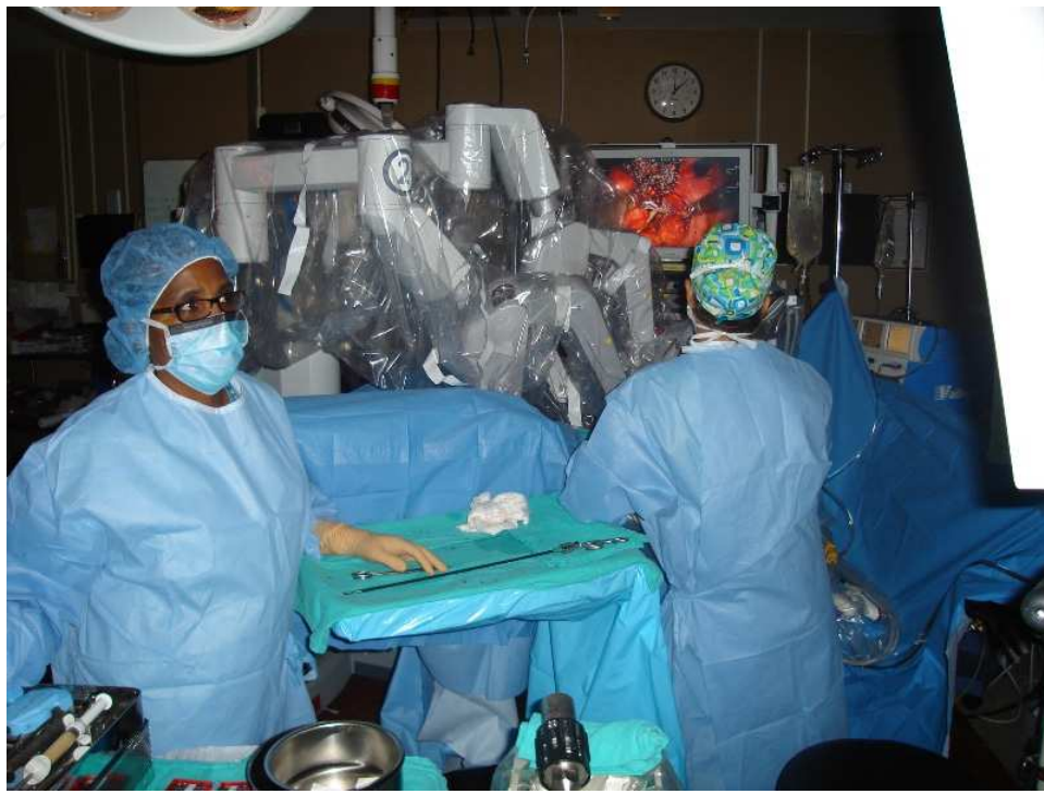
Fig. 1. Robotic surgery

Non-invasive continuous monitoring of total hemoglobin is now possible with the Rainbow Pulse CO-Oximeter® by Masimo® Corporation (figure 2), licensed for use in the US in 2010. This is of great advantage during certain types of surgeries traditionally associated with much blood loss like cardiac surgery, liver surgery, and in monitoring ANH.