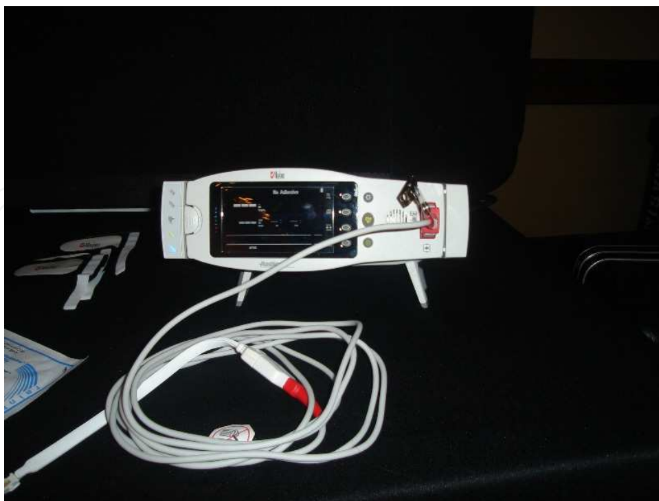
Fig. 2. Pulse CO-Oximeter®