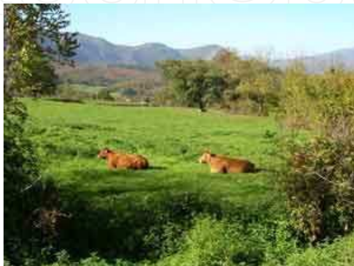
Fig. 2. Landscape of the studied area

In this studied area, in the northern sector, the winters are cold and humid and the summers are cold. Vegetation under Atlantic influences consists in oakwood and beechwood, with brushwood. In the southern sector is submediterranean and shows similar winter but hottest summers. Vegetation consists in gall-oak groves and holm-oak wood, being brush scarce (Roman et al., 1996; Dominguez, 2004). Mean summer temperatures in this area range between 16 and 20°C, while mean winter temperatures range between 2 and 5°C. Rainfall is usually high in winter at some 900-1100 mm/year. Altitude is ranging between 600-800 meters on the plateau. Climatic differences among different areas of Spain are responsible of both, the diversity of tick species and the circulation of tick-borne pathogens.