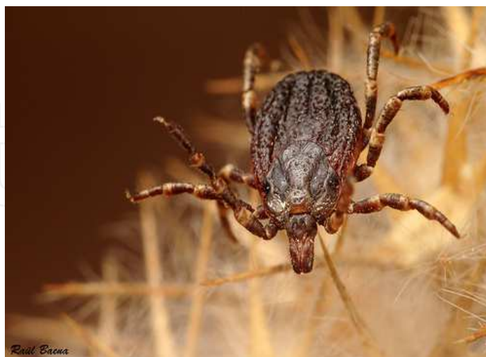
Fig. 1. Adult of Hyalomma lusitanicum

In this sense, Genus Hyalomma is a phylogenetically young group of ixodid ticks. As proposed Kolonin (2009), domestication and the development of cattle-breeding stimulated the evolution and biological progress of this group. These transformations continue to this day, as is apparent from the great number of intraspecific forms. Hyalomma ticks (Figure 1) are medium to large sized, with prominent mouthparts. Most species are 3 hosts, but there are also 1 and 2 hosts. Some species of this genus can use 1, 2 or 3 hosts to develop according to the host they found. The life cycle can last between 3-4 months and more than a year, depending on species and climate. The nymphs and adults stay overwinter in cracks and crevices between the stones of walls and barns, or uncultivated grasslands. Adults are found throughout the year, although the parasite load is higher in spring and summer, parasitizing deer and wild boar. Larvae and nymphs parasitize rabbits and are more prevalent in spring. Though this genus is usually restricted to the Mediterranean region, one of the species, Hyalomma lusitanicum , Koch 1844 ( Ixodoidea: Ixodida ) has a widespread distribution in some regions of Southern Spain, from which is introduced by wild animals (Encinas-Grandes, 1986).