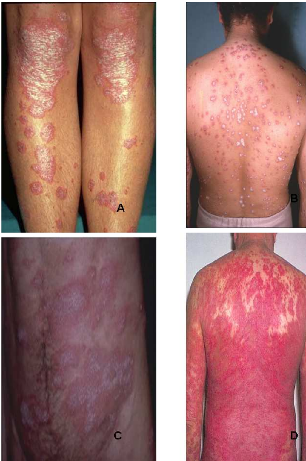
Fig. 1. Psoriasis clinical manifestations: A - chronic plaque psoriasis, B - guttate psoriasis, C - pustular psoriasis, D - erythrodermic psoriasis (With permission of Américo Figueiredo, PhDMD, and of Hugo Oliveira, MD).

Psoriatic arthritis is a seronegative inflammatory arthritis that occurs in the presence of psoriasis vulgaris . Five types of this psoriasis have been proposed: distal interphalangeal