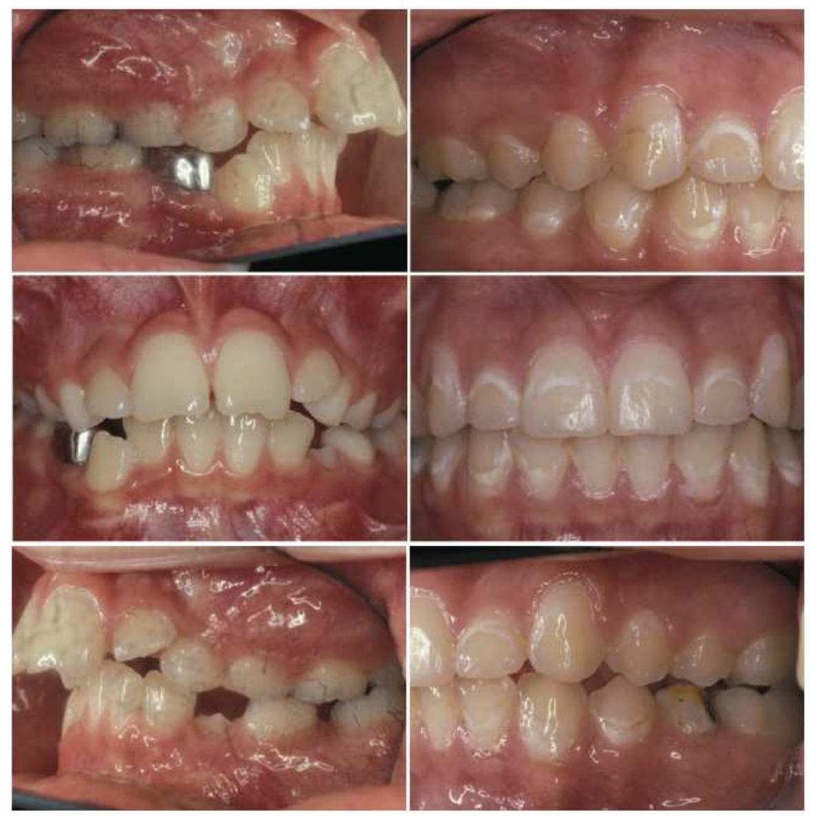
Fig. 2. Tooth labial surfaces were examined and scored from left first molar to right first molar, maxilla and mandible, before and after orthodontic treatment.

Images were evaluated by trained investigators using a scoring system specifically adapted for use with photographed images ( International Caries Detection and Assessment System II ; Ismail, 2005). Visible labial surfaces examined included maxillary and mandibular central and lateral incisors, canines, first and second premolars, and first molars. The evaluators scored each visible labial tooth surface before and after orthodontic treatment. The scores were combined to determine the labial caries incidence for each patient. Teeth were examined and scored from first molar to first molar, maxilla and mandible (Fig. 2).