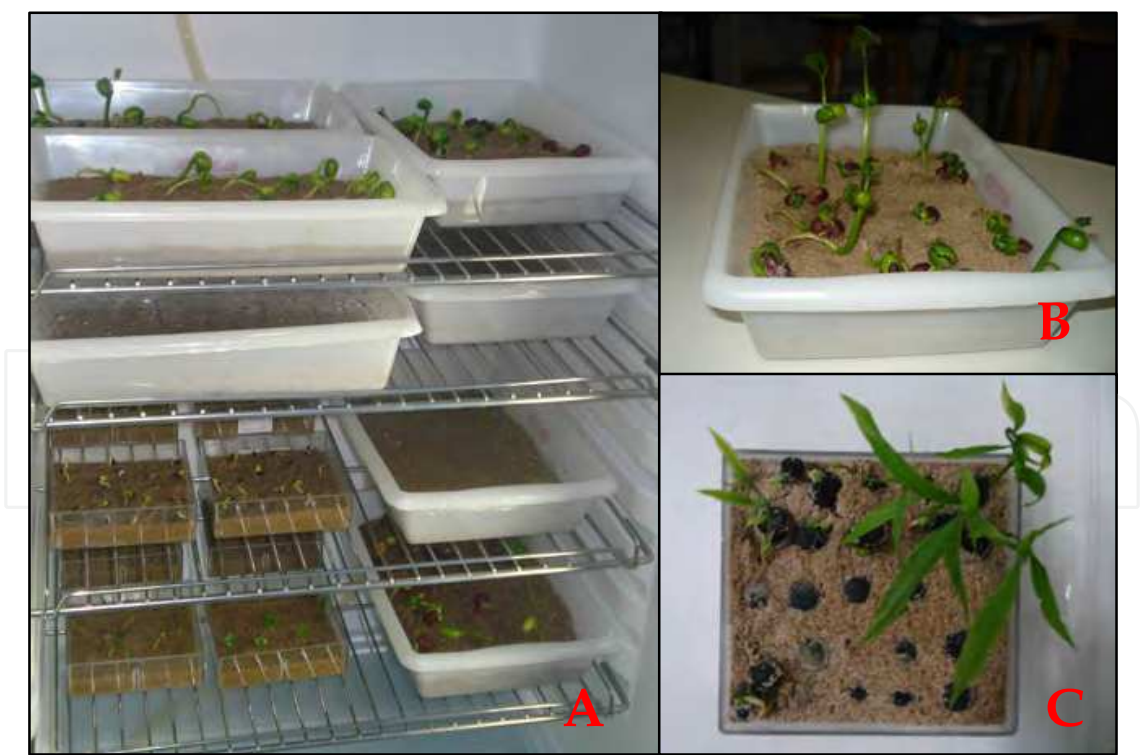
Fig. 2. Analysis of viability of seeds lots in the laboratory by testing them in a germination camera (BOD), at constant temperature and under continuous lighting, before the implementation of direct sowing in the field (A); Germination of the seed lots of Erythrina velutina Wild (B) and Sapindus saponaria L (C).