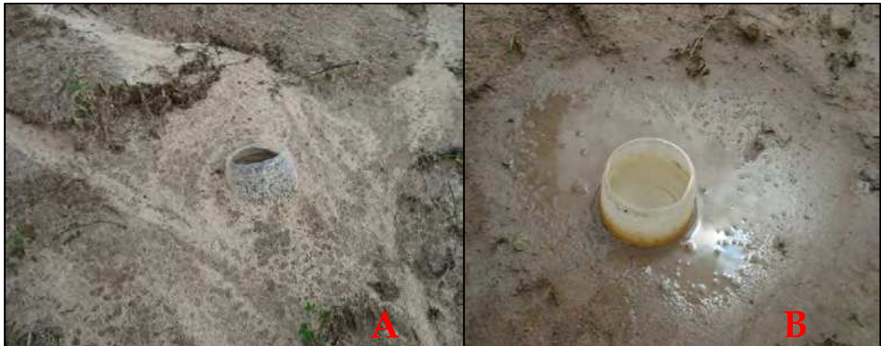
Fig. 3. Presence of water in the physical protector (A) and burial through laminar erosion (B) after rainy season in a pasture area located in the municipality of São Cristovão, Sergipe, Brazil, after the implementation of direct sowing (Source: Santos, 2010).

One of the first experiments performed by using direct sowing in Brazil is mentioned by Silva Filho (1988) where tests were conducted in an attempt to recover zones in severe conditions of degradation located in Serra do Mar (Hill), São Paulo. Considering the high slope steepness, Brachiaria seeds were sown, but due to the rains, they were dragged to the bottom of the hill, promoting great emergence of seedlings in this area.