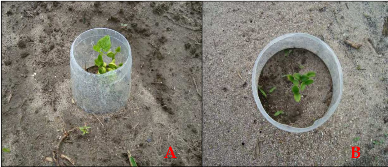
Fig. 4. Direct sowing of the species Erythrina velutina Wild (A) and Bowdichia virgilioides Kunth (B) through the use of physical protectors for germination.

According to Ferreira et al. (2007), the use of plastic protectors was not effective either for the emergence or for the survival of seedlings, for the pioneer species: Senna multijuga , Senna macranthera , Solanum granuloso-leprosum and Trema micrantha (Table 2). On the other hand, the use of physical protectors, similar to those employed by Ferreira et al. (2007), was effective for the survival of the seedlings of the climax species such as Cedrella fissilis , Copaifera langsdorffii , Enterolobium contortisiliquum , Piptadenia gonoacantha and Tabebuia serratifolia , mainly preventing the attack of ants as observed by Santos Jr et al. (2004).