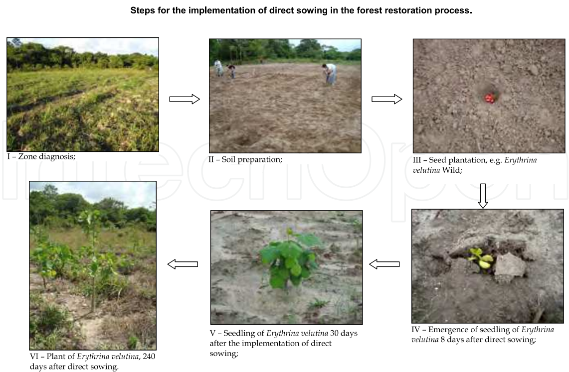
Fig. 1. Illustration of steps required for the implementation of direct sowing in the process of restoration of degraded and riparian zones (Pictures of Santos, 2010).