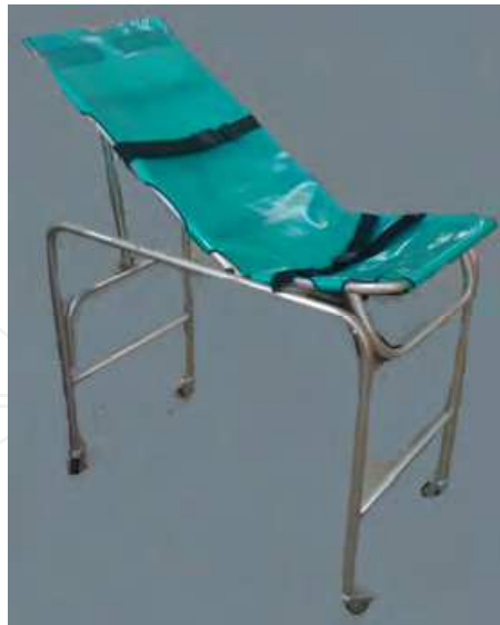
Fig. 5. Bath chair with recline tilt system.

Among these AT devices aimed for bathing or showering that have specific features to the demands imposed by more severely handicapped users, there are other models whose dimensions meet more specifically children and teenagers. These models, in their own constitution, usually have a range of resources appropriate to meet some specification, such as lack of motor control, including absence of neck control, insufficiency or default of trunk control, persistency of primitive reflexes and/or involuntary movements difficult to control, a situation that is compatible to people that with cerebral palsy or other disease that seriously compromise the musculoskeletal system.