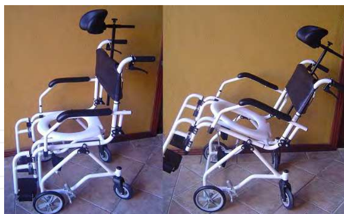
Fig. 4. Aluminum bath chair with backrest and headrest tilt system.

The presence of arms and legs support, which might be retractable or removable, supplement the necessary resources that permit a better accommodation of the user. Although the equipment presents more adequate features, the needs of more severely compromised people in the physical aspect, and the possibility of changing the adult toilet seat to a child one, implies that the dimensions offered by the equipment makes its designation more appropriate especially to adults.