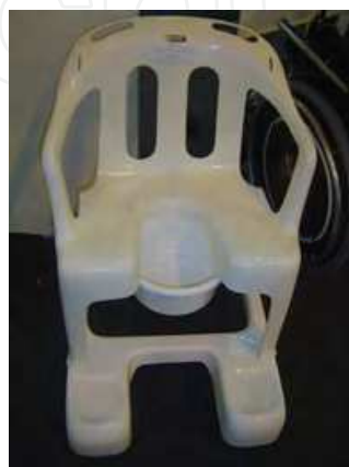
Fig. 2. Chair with cut out seat.