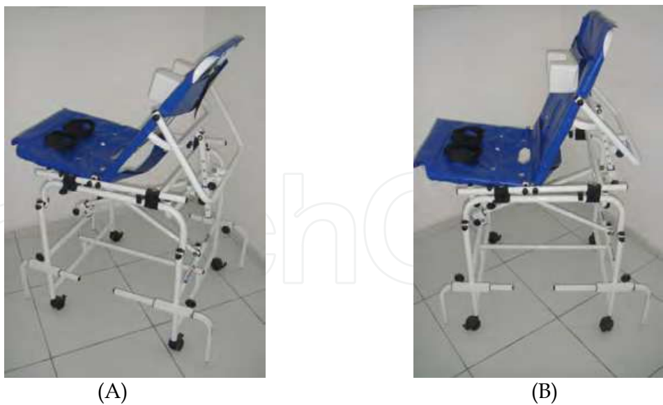
Fig. 6. Youth bath chair: (A and B) Removable base with height adjustment and belt and headrest system.

Other bath chair models (Figures 7 and 8) are designed to serve severe motor impairment users also have similar aspects, differentiating in some structural features, design and accessories. They are products whose tubular structure is often made of aluminum and the seat and back set consists of a polyurethane shell form-fitting, with or without holes, whose function is let the water flow during bath or shower.