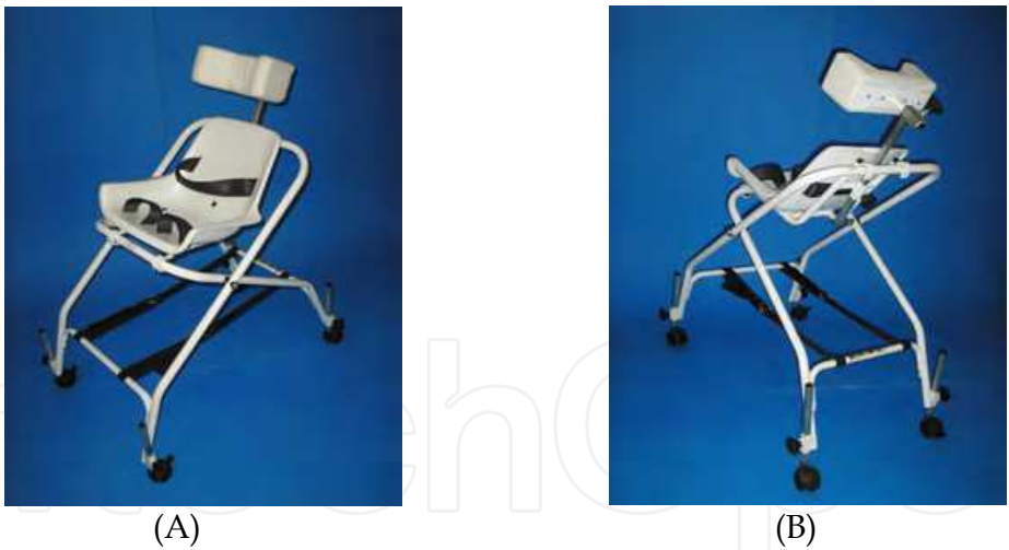
Fig. 7. Infant bath chair: (A) anterolateral view; (B) posterior-lateral view.

Other bath chair models (Figures 7 and 8) are designed to serve severe motor impairment users also have similar aspects, differentiating in some structural features, design and accessories. They are products whose tubular structure is often made of aluminum and the seat and back set consists of a polyurethane shell form-fitting, with or without holes, whose function is let the water flow during bath or shower.