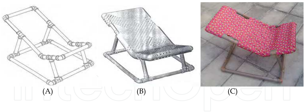
Fig. 10. (A) and (B): PVC pipes and connections structure; (C) Final craft model.

This chapter sought to present some directions for the prescriptions of AT devices, such as bath chairs, available in Brazil, for disabled people, especially physical commitment. Besides, it tried to provide, for the ones who work with handicapped people, relevant information regarding AT equipments that exist to maintain sitting posture during bath or shower.