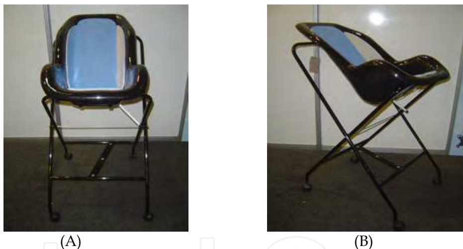
Fig. 8. Bath chair: (A) anterior view; (B) side view.

The bath chair presented in Figure 8 is a device produced by a small business, made of painted steel, with a seat and back system made by a plastic sheet and non-slip fabric. It has an "X" locking system concerning its width, while its length remains unchanged after being closed. As it is a tailored-made product, it is possible to get it according to the user measures, caregiver height and dimensions of the environment in use. The presence of foot casters for favoring moving is optional, although, because the seat and backrest are fixed, it is often necessary its transportation to be dried and cleaned.