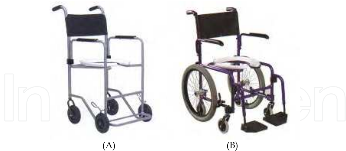
Fig. 3. Adult aluminum shower bath chairs: (A) Fixed structure and (B) Folding structure for closing.

the position of the head against gravity; moreover, the bending system of the seat and back group ("tilt") of up to 35^\circ allows a better accommodation for a person with absent or insufficient trunk control, who are unable to remain seated without support.