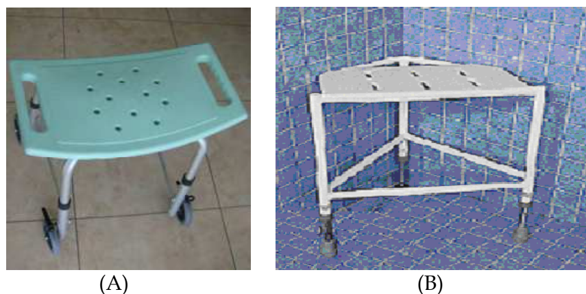
Fig. 1. Models of stools: (A) Four support stool with height adjustment; (B) Edge stool with adjustable height.

The more commonly available equipments to help a person who needs support to remain sitting during shower or bath because of temporary or permanent motor commitment. There are many models in the market which can be made specifically for this purpose, as well as other ones that are available for other purposes but adapted for such task. Most of the conventional models are made of plastic with rubberized coating with variations in their design in relation to the model and dimension of the seat and backrest, armrest and variation in height (Figure 1 and 2).