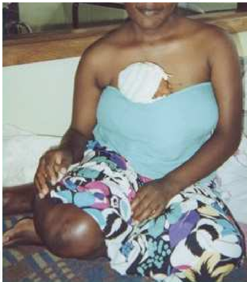
Fig. 1. Kangaroo Mother Care

The impact of cup feeding or bottle feeding on weight gain, oxygen saturation, and breastfeeding rates of preterm infants was examined in 34 bottle-fed and 44 cup-fed preterm infants (Rocha et al, 2002). No significant differences between groups were found with regard to time spent feeding, feeding problems, weight gain, or breastfeeding prevalence at discharge or at 3-month follow-up. Possible beneficial effects of cup feeding were lower incidence of desaturation episodes and a higher prevalence of breastfeeding at 3 months of age (Rocha, et al., 2002).