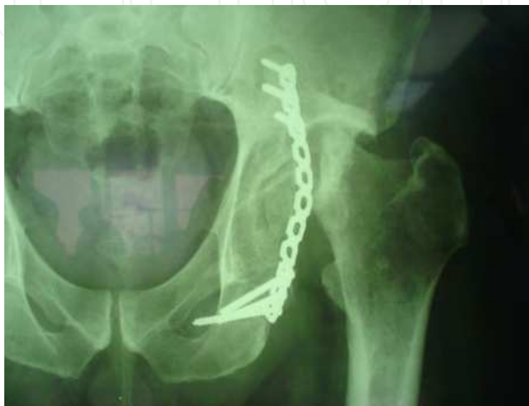
Fig. 4. bone defect of acetabulum.

of them with structural bone (allograft or autograft), if it is large and bone contact between host bone and cup is minimal (less than 30%), it may compromise osteointegration and also the cup can not be inserted with press fit technique, so cemented cup is preferred. It is accepted that if more than 1/3 of cup is in contact with graft, it is better to use cemented prosthesis. About femoral stem, because of younger age of these patients, nearly always it is better to use cementless stems.