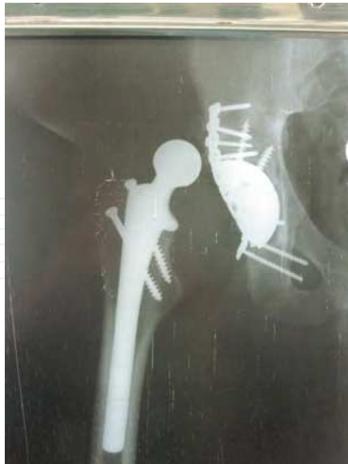
Fig. 9. Dislocation of total hip prosthesis.