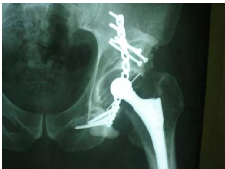
Fig. 5. reconstruction of defect with bone graft and cemented cup.