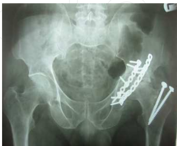
Fig. 1. Avascular necrosis of head of femur.

In post operative period, acutely or chronically, there may be some complications which may be solved by total hip replacement. One of them is avascular necrosis of head of femur. Some acetabular fractures are truly fracture dislocations and even after reduction and rigid fixation, because of injury to vascular supply of head of femur, necrosis and collapse of head of femur develop in early period or as a late complication. Specially with posterior approach to hip joint (Kocher langen beck approach), there may be injury to main vascular supply of head of femur (medial femoral circumflex artery). With disruption of blood input to the head of femur, signs and symptoms of necrosis will be appeared. Because of rapid progression of collapse and joint destruction in these cases, minor surgeries like core decompression and osteotomies are ineffective and finally total joint replacement is inevitable.