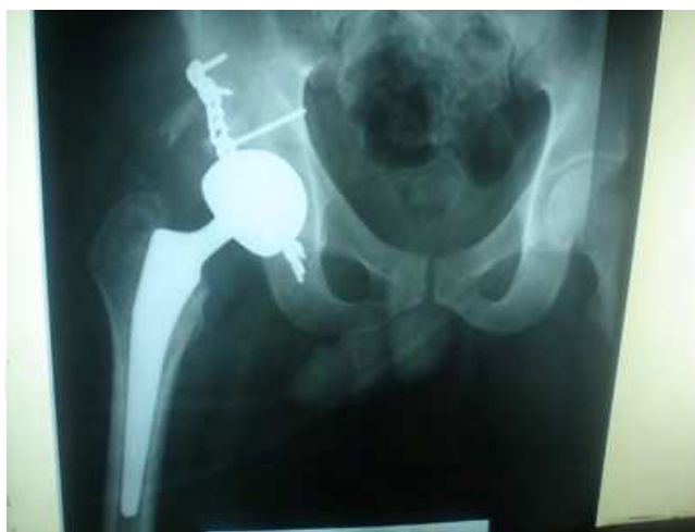
Fig. 7. Bipolar prosthesis for avascular necrosis of head of femur after acetabulum fracture fixation.