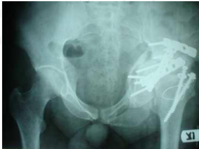
Fig. 2. Destructive joint disease after acetabulum fracture.

One of the most common complications of acetabular fractures are destructive joint disease. Because even with surgery and open reduction of acetabulum, anatomic reduction may not be possible( after some days because of contracture of soft tissues, joint particles may not come near each other and perfect reduction may not be achieved) and remaining steps in joint surface may lead to destructive joint disease after union of fracture and weight bearing on lower extremity.