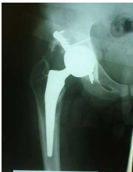
Fig. 8. Rapid wear of acetabulum with bipolar prosthesis (after 5 months).