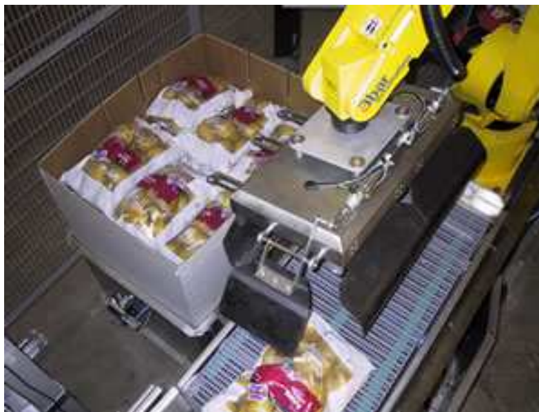
Fig. 1. Pack rotation carry out by an ultra reliable (Courtesy: Abar automation, 2009).

The robot is often guided by a vision system (Piasek, 2010). Pick and place robot cells (Fig. 1) are available for pre-packed bags or trays containing fresh or processed vegetables, salads or mushrooms ranging in weights from a few grams to 50 kg, and are capable of loading plastic crates and roll containers (Abar automation, 2011 & Robots & Robot Controllers Portal, 2010).