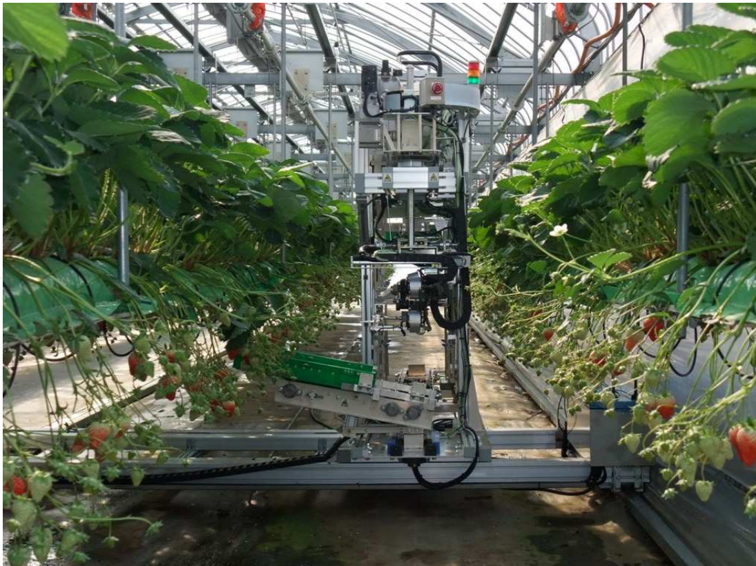
Fig. 3. A harvesting robot of strawberry.