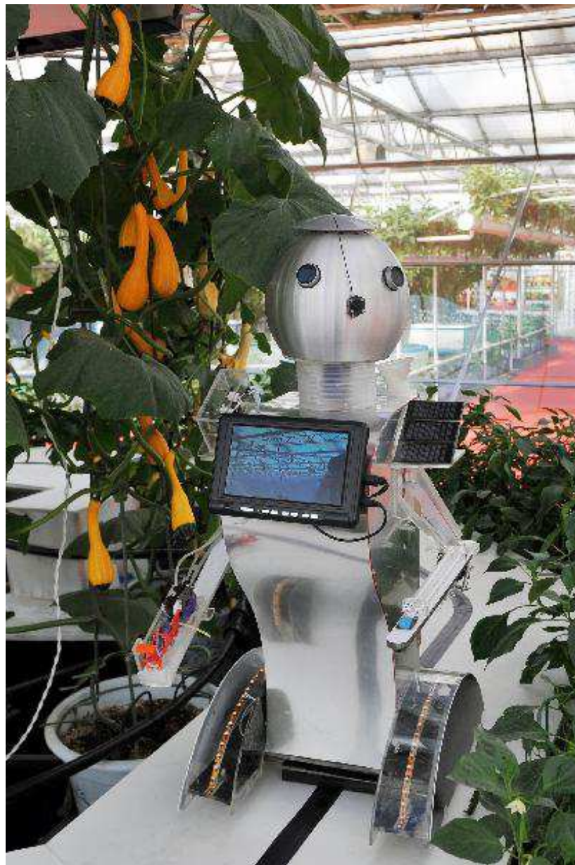
Fig. 2. A robot for vegetable planting

humidity, light, detect disease of the vegetables and pick up the ripe ones through identifying the colour.