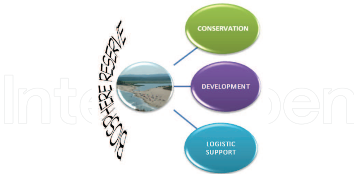
Fig. 1. Biosphere reserves functions

The main principal tasks of biosphere reserves are as detailed below (The Federal Ministry for The Environment, 2007):